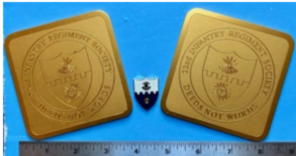
Coasters: $7.00 each. Shipping for 2, $3.00 **