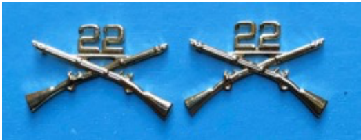
22 nd Infantry Crossed Rifles: $9.00 ea. $18.00 per set