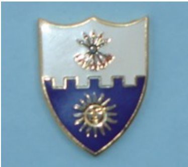
Unit Crest [DUI] $10.00 Shipping: $6.00 **