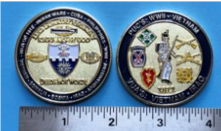
Challenge Coins One coin: $12.00. Shipping included Five Coins: $11.00 each + $10.00 Shipping 10 Coins: $10.00 each + $19.00 shipping 15 coins: $9.00 each + $28.00 Shipping 20 Coins: $8.00 each + $38.00 shipping