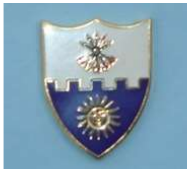
Unit Crest [DUI] $7.00 Shipping: $3.00 **