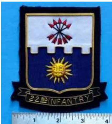
Blazer Patch: $10.00 Shipping: $3.00**