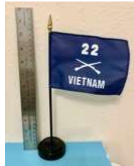
Mini Flag: $5.00 Shipping: $3.00**