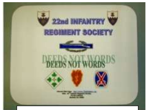
Mouse Pad: $5.00 Shipping: $3.00 **

**These item shipped without charge if ordered with hats or shirts.