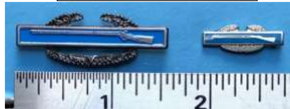
Mini CIB: $5.00. Midi CIB: $7.00 Shipping: $3.00 **