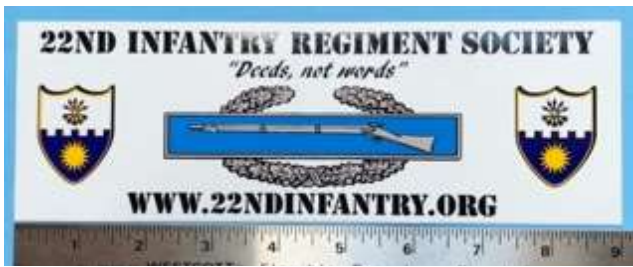
Bumper sticker $3.00