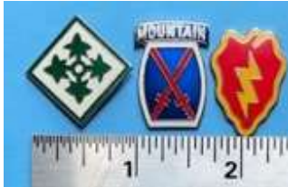
Divisional Pins Small $5.00 Large qw$7.00 Shipping is $3.00 per pin**

One coin: $14.00. Shipping included Five Coins: $11.00 each + $5.00 Shipping 10 Coins: $10.00 each + $7.00 shipping 15 coins: $9.00 each + $10.00 Shipping 20 Coins: $8.00 each + $10.00 shipping