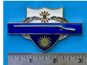
CIB/DUI: $12.00 Shipping : $3.00 **