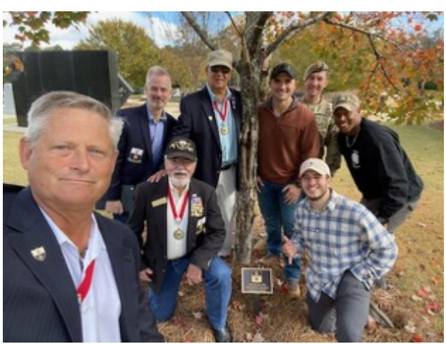
22<sup>nd</sup> Infantry Regiment Legacy Tree