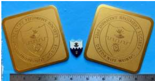
Coasters: $5.00 each. Shipping for 2, $3.00 **