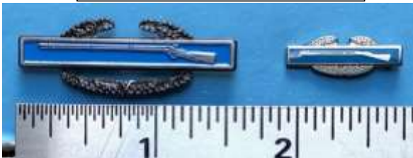
Mini CIB: $5.00. Midi CIB: $7.00 Shipping: $6.00 **