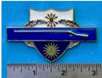
CIB/DUI: $12.00 Shipping : $6.00 **