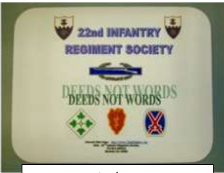
Mouse Pad: $5.00 Shipping: $3.00 **

**These item shipped without charge if ordered with hats or shirts.