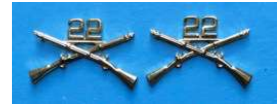
22 nd Infantry Crossed Rifles: $14.00 per set Shipping: $6.00**