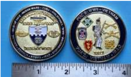
Challenge Coins One coin: $14.00. Shipping included Five Coins: $11.00 each +$5.00 Shipping 10 Coins: $10.00 each + $7.00 shipping 15 coins: $9.00 each + $10.00 Shipping 20 Coins: $8.00 each + $10.00 shipping