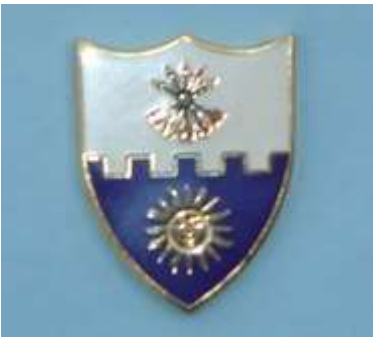
Unit Crest [DUI] $7.00 Shipping: $6.00 **