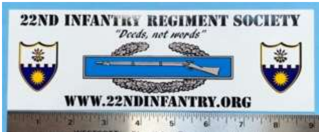
Bumper sticker $3.00