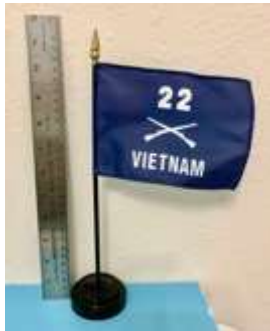
Mini Flag: $5.00 Shipping: $6.00**