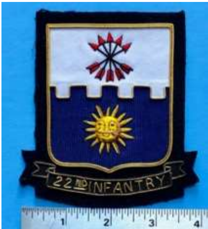
Blazer Patch: $10.00 Shipping: $3.00**