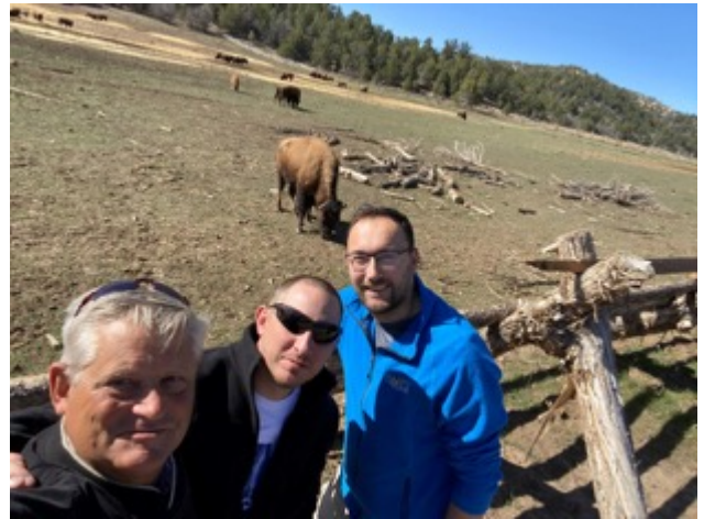
There are no Bison Ranches in France-Go figure