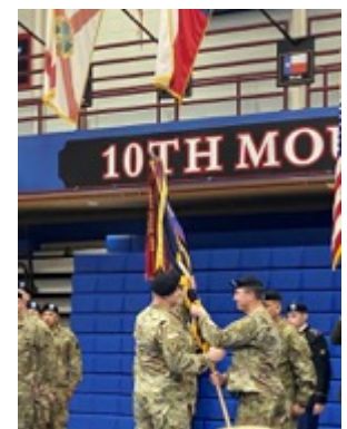
2 nd Battalion 22 nd Infantry Change of Command March 22, 2022