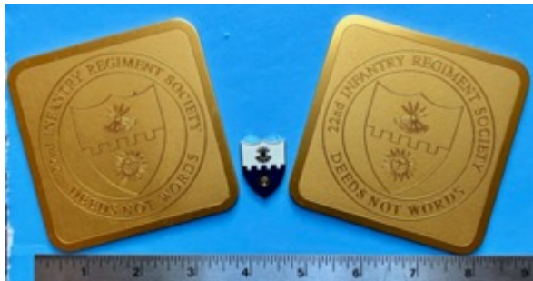
Coasters: $5.00 each. Shipping for 2, $3.00 **