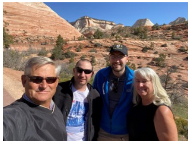
22 nd infantry visits Zion National Park, Utah