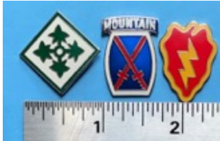
Divisional Pins Small $5.00 Large qw$7.00 Shipping is $3.00 per pin**