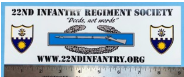
Bumper sticker $3.00