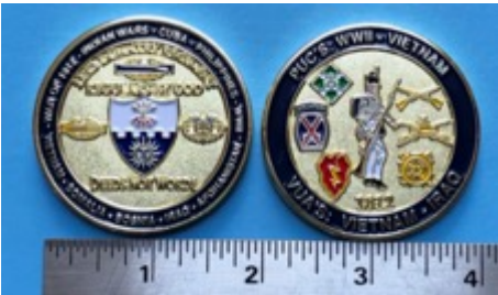
Challenge Coins One coin: $14.00. Shipping included Five Coins: $11.00 each + $5.00 Shipping 10 Coins: $10.00 each + $7.00 shipping 15 coins: $9.00 each + $10.00 Shipping 20 Coins: $8.00 each + $10.00 shipping