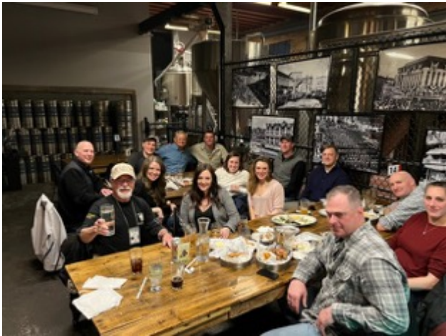
Leadership Party celebrating the Triple Deuce Change of Command