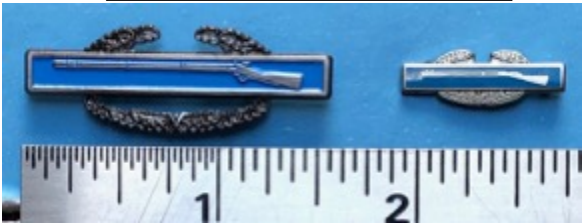
Mini CIB: $5.00. Midi CIB: $7.00 Shipping: $3.00 **