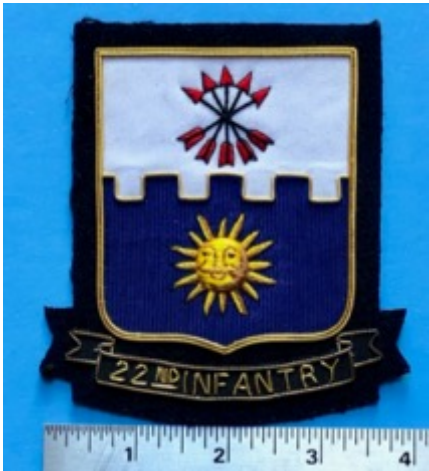
Blazer Patch: $10.00 Shipping: $3.00**