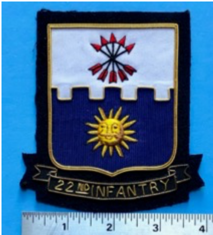
Blazer Patch: $10.00 Shipping: $3.00**