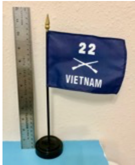
Mini Flag: $5.00 Shipping: $6.00**