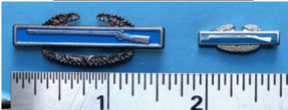
Mini CIB: $5.00. Midi CIB: $7.00 Shipping: $6.00 **