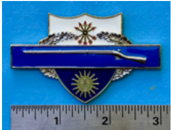
CIB/DUI: $12.00 Shipping : $6.00 **