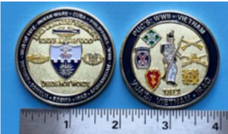
Challenge Coins One coin: $14.00. Shipping included Five Coins: $11.00 each +$8.00 Shipping 10 Coins: $10.00 each + $16.00 shipping 15 coins: $9.00 each + $24.00 Shipping 20 Coins: $8.00 each + $32.00 shipping