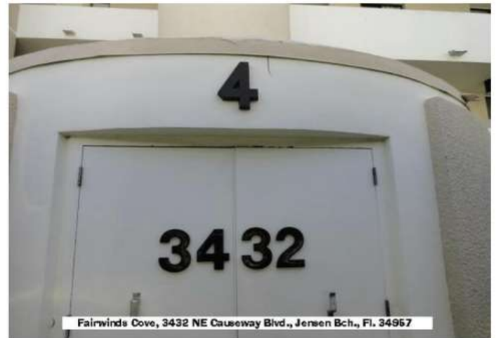
Fairwinds Cove, 3432 NE Causeway Blvd., Jensen Bch., Fl. 34957