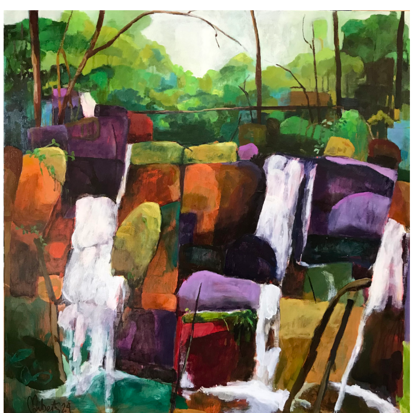
LIBERTY FINN Sherbrooke Falls 80 x 80cm Oil & acrylic on board $1250