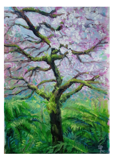
DOMINICA POLLEY BLOSSOMS IN RAINFOREST oil on canvas paper, framed $400