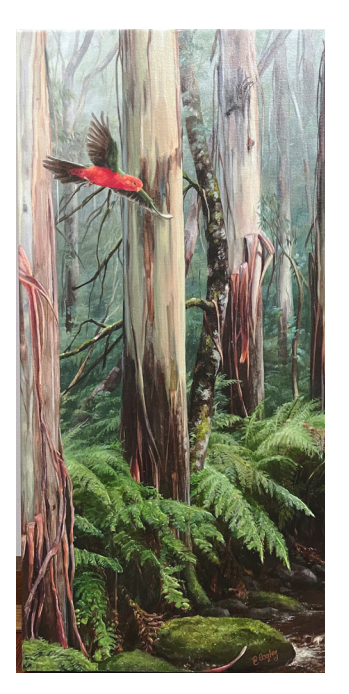
ELIZABETH COGLEY THE LANDING 1 archival print on canvas L/E $275