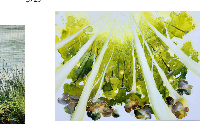
INGE MARIE TERKILDSEN FOREST BATHING acrylic on linen, framed $595