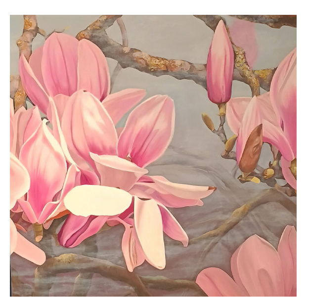
SUSSANNE MORTON SOMEWHERE OUT THERE AT TINDALES oil on linen $3750