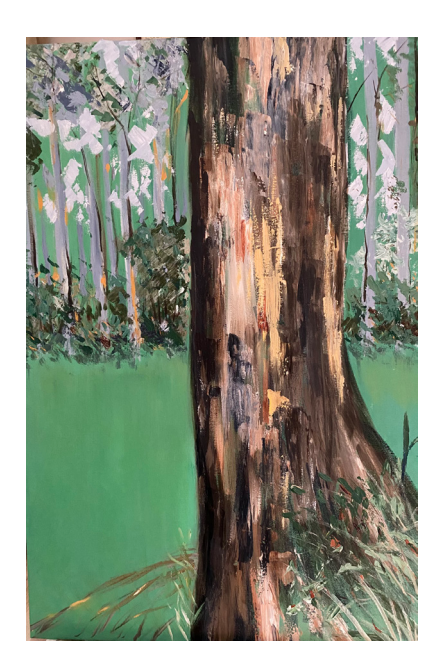
VICKI SINGLETON AFTERNOON DELIGHT acrylic on canvas, framed $900