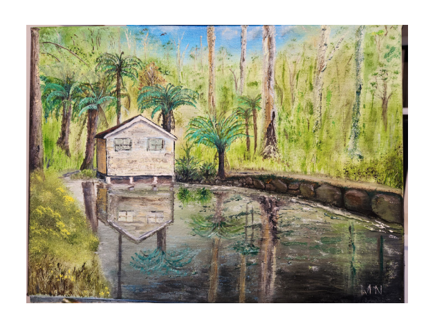
MARTIN NOONAN THE BOATHOUSE Oil on canvas, blackwood frame $525