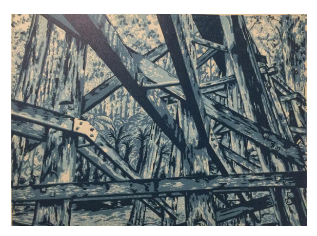
CHRIS LAWRY UNDER THE BRIDGE multi block linocut print edition SY2 1/5 $650 framed