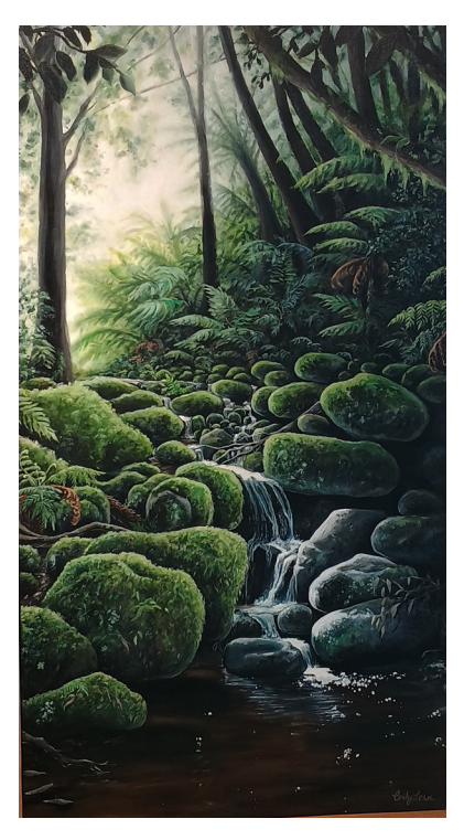
EMILY LOWE TRICKLING TRANQUILITY Acrylic on canvas, framed $3490