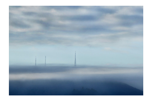
BRUCE WATSON STAY MISTY FOR ME 79 x 54cm Archival pigment print $500