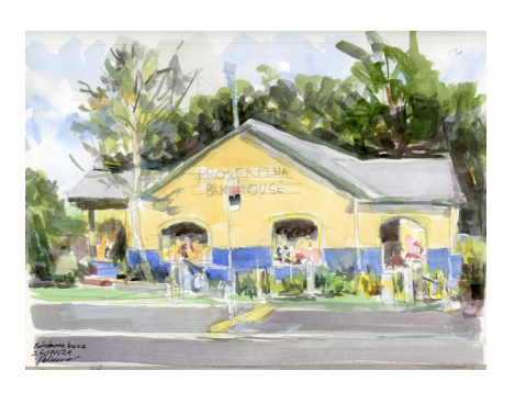
PETER FRIEDLANDER BAKEHOUSE BUZZ watercolor pencil on paper $300 framed