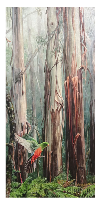
ELIZABETH COGLEY THE LANDING 2 archival print on canvas L/E $275