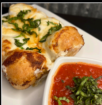
ALFREDO CHEEZY BUNS