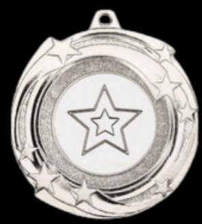
Score 100 - 119