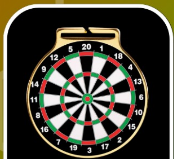
Score 0 - 79