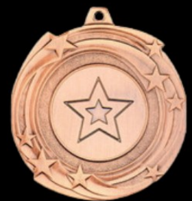
Score 80 - 99