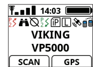
Day - High Contrast