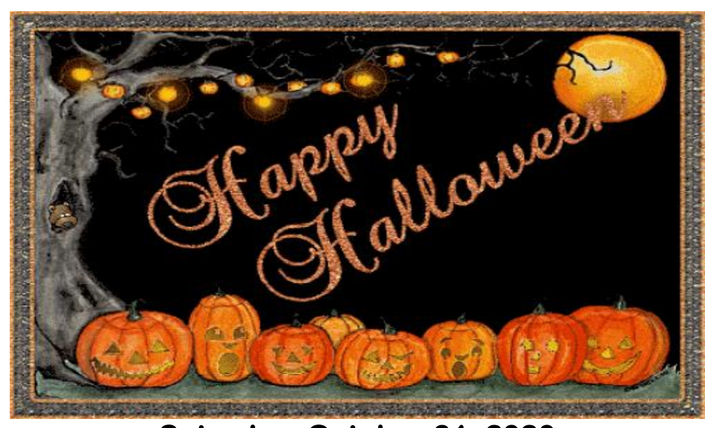
Saturday, October 31, 2020