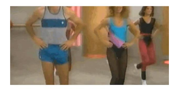
SAT. FEB 22 AT 7:00 AM - 8:30 PM