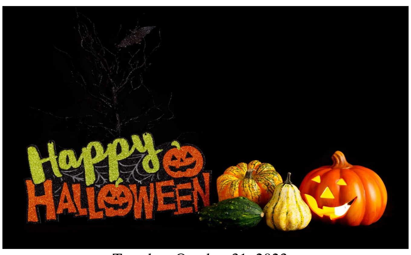
Tuesday, October 31, 2023