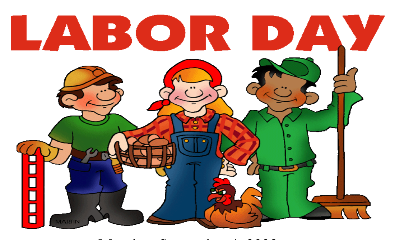
Monday, September 4, 2023