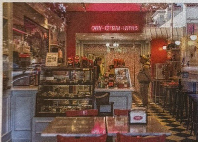
Shaws is a 93-year-old ice cream and candy shop in West Portal, a multigenerational neighborhood.

West Portal's appeal for business owners is obvious. It's an enduring, multigenerational neighbor-