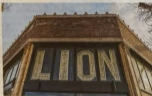
Sushi restaurant Lion West Portal has taken over the site of the former Fuji Japanese Restaurant.

It's not just Elena's, which reportedly drew waits as long as four hours in its first few weeks. As post-pandemic slumps and