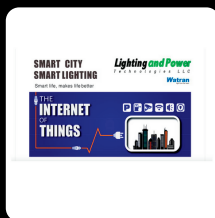
Smart City IoT