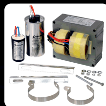
Magnetic HID Ballasts