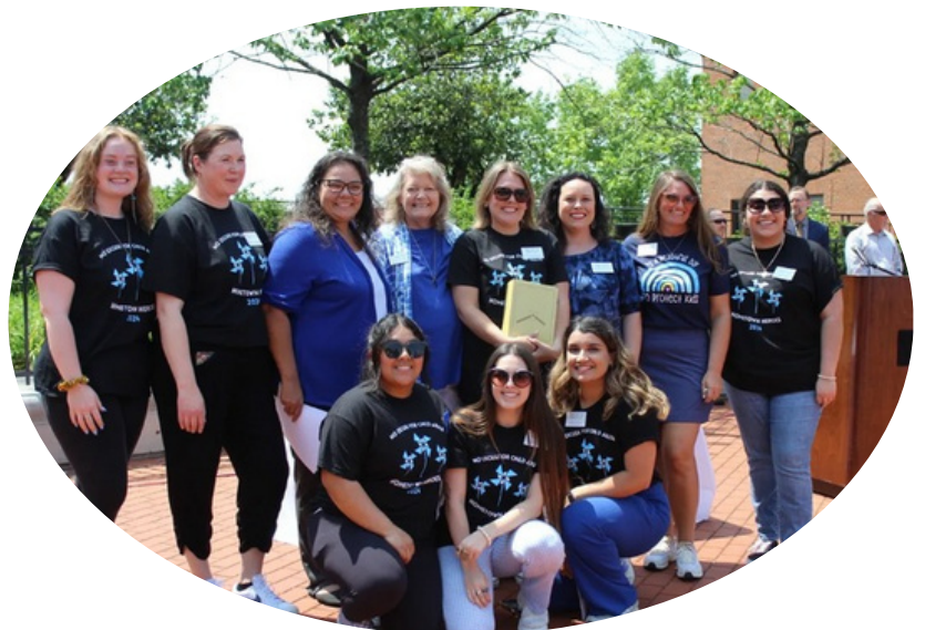
Our CAC Staff

The Child Advocacy Center works as a multidisciplinary team with Department of Children's Services, law enforcement, and the District Attorney's Office to investigate and prosecute child abuse and child sexual abuse cases. Department of Children's Services protects children. Law enforcement investigates the crime. The District Attorney's Office chairs the team and aggressively prosecutes offenders. The Child Advocacy Center interviews child victims, provides crisis intervention counseling, assists families, helps children heal from the trauma, and helps families rebuild their shattered lives. In the last 25 years, the Child Advocacy Center has served 49,427 individuals and positively impacted the lives of 13% of the population of Rutherford and Cannon Counties.