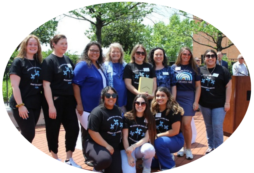
Our CAC Staff

The Child Advocacy Center works as a multidisciplinary team with Department of Children’s Services, law enforcement, and the District Attorney’s Office to investigate and prosecute child abuse and child sexual abuse cases. Department of Children’s Services protects children. Law enforcement investigates the crime. The District Attorney’s Office chairs the team and aggressively prosecutes offenders. The Child Advocacy Center interviews child victims, provides crisis intervention counseling, assists families, helps children heal from the trauma, and helps families rebuild their shattered lives. Since 2000, the Team has made a difference in the lives of 44,676 people in Rutherford and Cannon Counties, 13% of the population of our community.