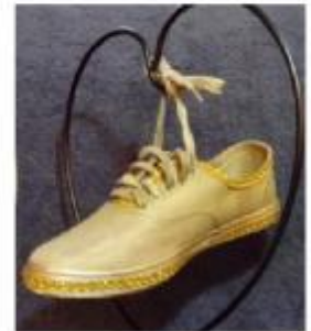
Top Team wins The GOLDEN SNEAKER for a year!

9:30 am Rain or Shine (Registration begins at 8:45)