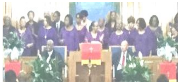
White Oak Missionary Baptist Church