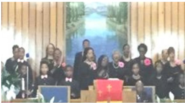
CBC Combined Choir