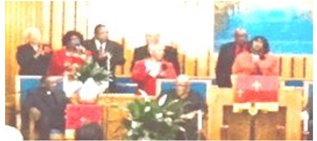
New Calvary Missionary Baptist Church