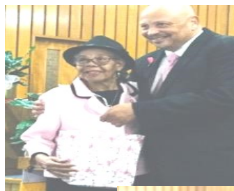
Several CBC Cancer Survivors