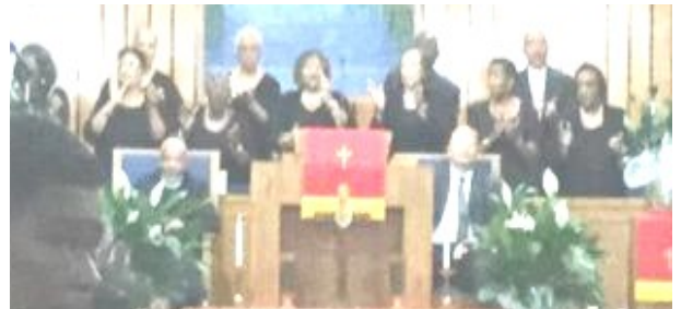
Mt. Level Baptist Church