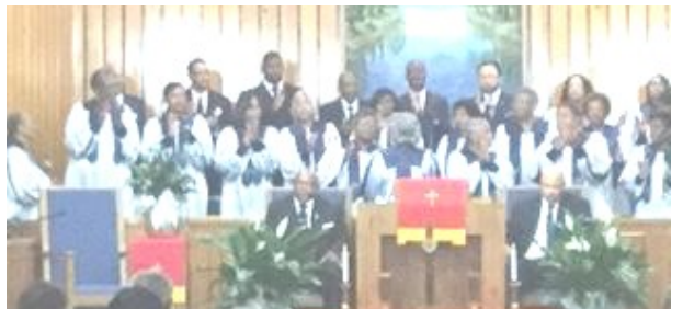
Peace Missionary Baptist Church