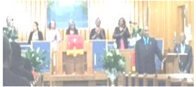
Community Baptist Church Praise & Worship Choir