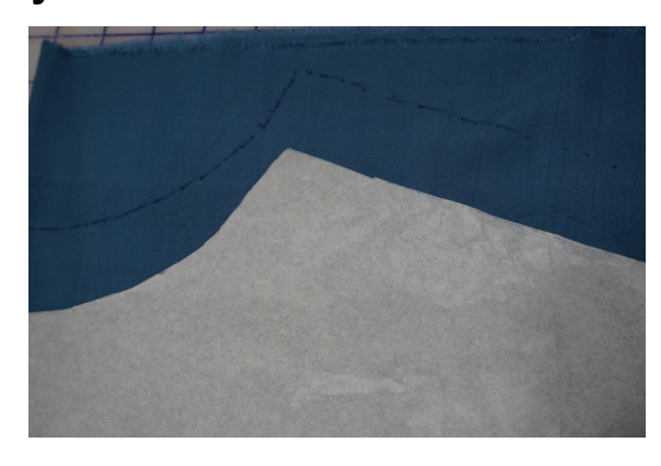
Trace neck but do not cut out