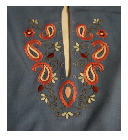
Turn interfacing to wrong side and press making sure seam is on the edge.