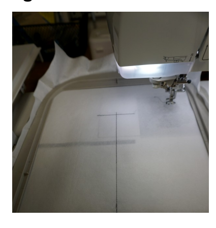
Placement line stitched on stabilizer