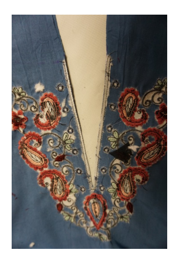
Cut down center of stitching