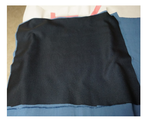
Cut interfacing the size of front. With right sides together (fusible will be facing up) stitch the last step in the embroidery.