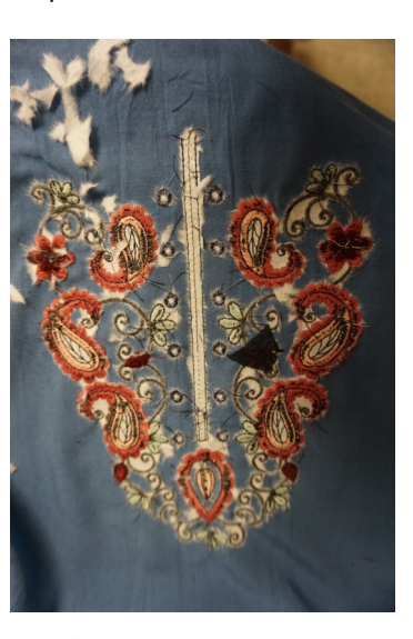
Remove stabilizer wash away or tear