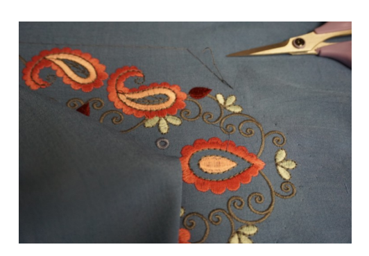
Remove outline stitch