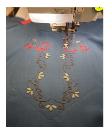
Line up center and marked neck with placement line and embroidery. Remove hoop do not take fabric off.