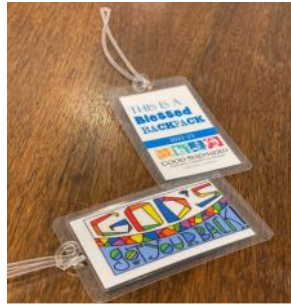
Above: Backpack tags for all!