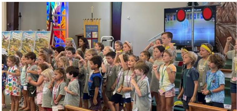
Above: Vacation Bible School kids practice one of their songs for our summer Rocky Railway experience. Over 60 students attended and we had a fantastic time exploring Bible stories and imagining ourselves on a railroad adventure! Thanks to all of the families who participated this year. We especially thank our adult and youth volunteers who made the week possible. Thank you!!!!