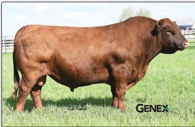
WFL MERLIN 018A