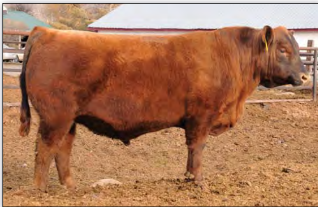
5L THE REAL DEAL 1687-143B