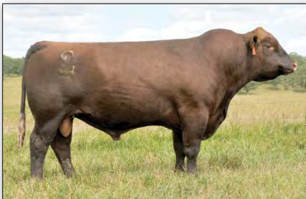
JACOBSON BLAZIN ON 0057, sire