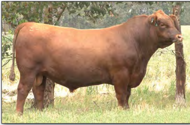
MILWILLAH MARBLE BAR J53

W MILWILLAH MARBLE BAR J53 #3567871 BD: 6/9/13 1A 100% Dam's MPPA: Dam's Age: 2 BW: 436 WW: 436 WR: YW: YR: %IMF: Ratio: REA: Ratio: