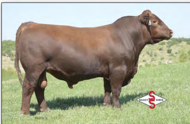
BROWN AA PRESTIGIOUS B5153