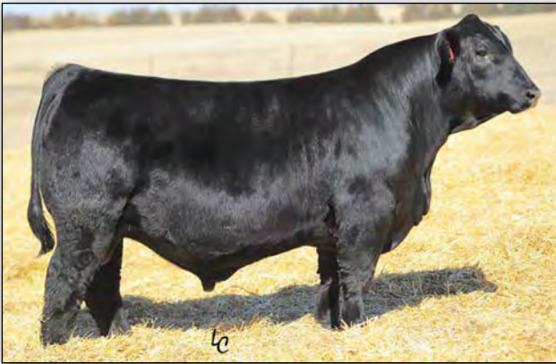
CCR WIDE RANGE 9005A, sire

J BCLR CASH FLOW C820 #3071303 BD: 3/5/15 PUREBRED POLLED BLACK BW: WW: WR: YW: YR: %IMF: Ratio: REA: Ratio: 923 119 1504 117 2.96 119 14.7 105 K CCR WIDE RANGE 9005A S D S GRADUATE 006X R BCLR MISS MONICA U820 CCR MS APPLE 9332W TRIPLE C INVASION R47K TNT MISS P82