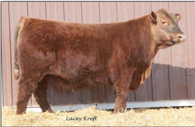
KUHNS DEFENDER C057