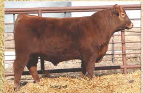
Lot 59 – KUHN'S ABSOLUTE RED G035 #4112114