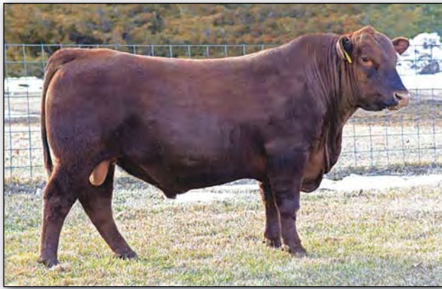
BROWN ORACLE B112