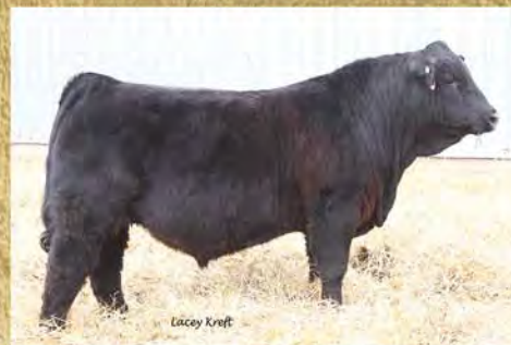
Lot 41 – CROSSHAIR 123G #3632420