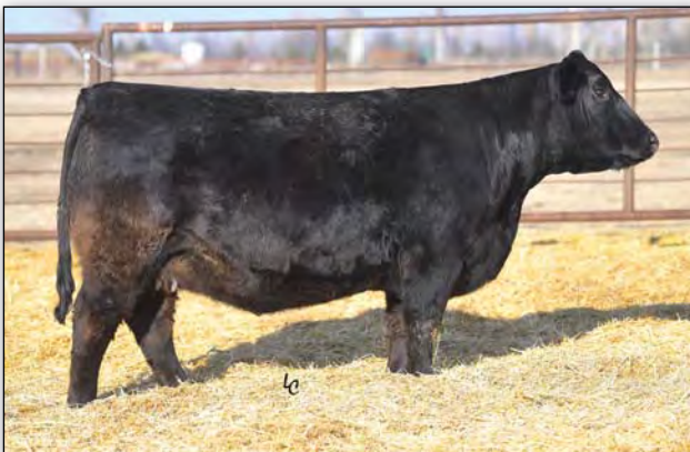
BCLR MISS WIDE RNGE D653, donor dam