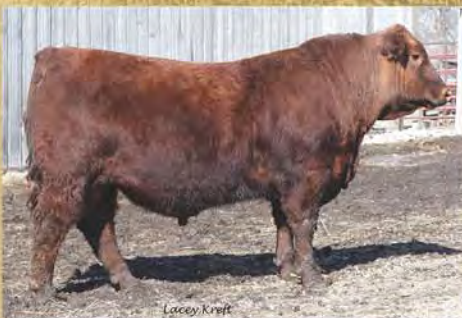
Lot 1 – HBR FORCE 903 #4177382

DVAuction Broadcasting Real-time Auctions