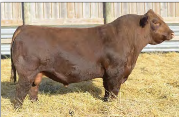
CDI PERSPECTIVE 238A

L CDI PERSPECTIVE 238A #2732012 BD: 3/22/13 PUREBRED POLLED RED BW: WW: WR: YW: YR: %IMF: Ratio: REA: Ratio: 732 105 1372 104 2.83 94 13.9 92 K HOOK'S XPECTATION 36X GW PREDESTINED 701T R CDI MS TRUMP 101Y HOOKS MIKA 141M NF TRUMP S582 CDI MS TOP GUN 5U