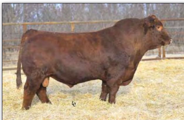
CDI AMBITION 255C