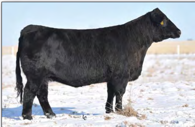
Double J Miss T739, dam of Lots 41, 42, 45,46 and 50