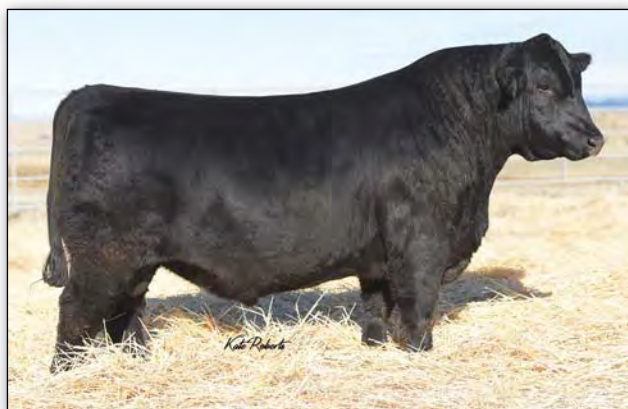
TNT UNION D385