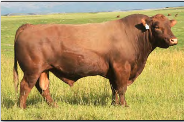
BUF CRK THE RIGHT KIND U199