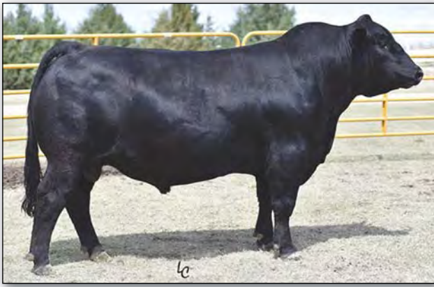
LRS A PLUS 219A