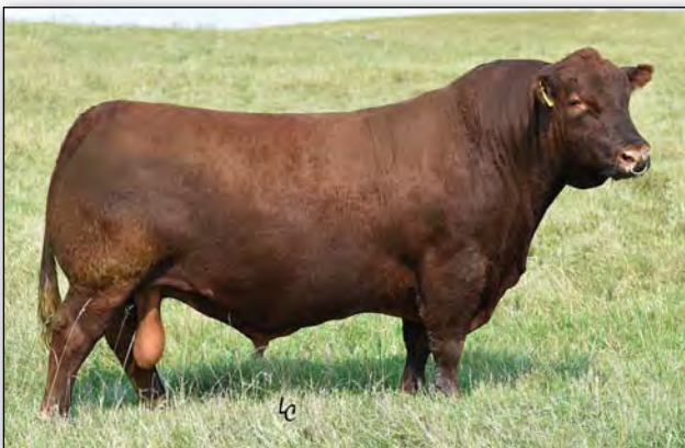
BIEBER ROLLIN DEEP Y118, paternal grandsire