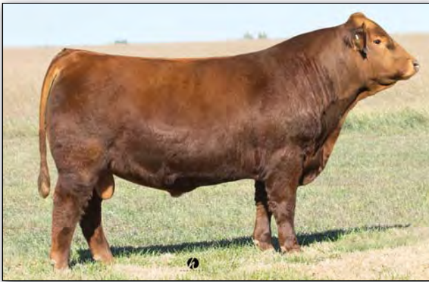
IR IMPERIAL D948