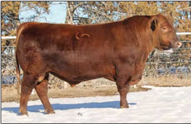
LSF SAGA 1040Y, sire