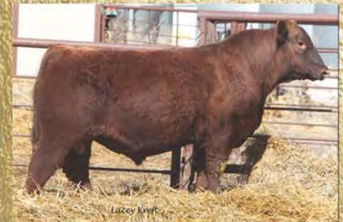
Lot 53 – KUHN'S ORACLE G005 #4112062

Kuhn's Red Angus • Crosshair Simmentals • Huber EY Red Angus