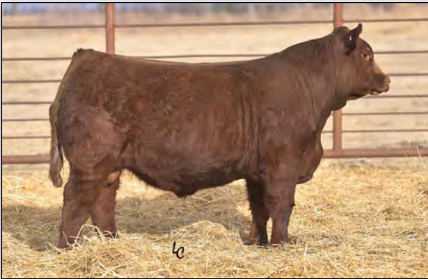
BCLR HEARTLAND E130

K BCLR HEARTLAND E130 #3322925 BD: 3/5/17 PUREBRED POLLED RED BW: WW: WR: YW: YR: %IMF: Ratio: REA: Ratio: 96 799 102 1382 105 1.61 77 16.4 115 K CDI AMBITION 255C HOOK'S XPECTATION 36X R CDI MS TRUMP 130Y HSF RED FORTUNES SIS 33 NF TRUMP S582 CDI MS CROCKET 88T