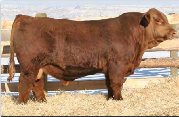
RYMO POWER SURGE G39D