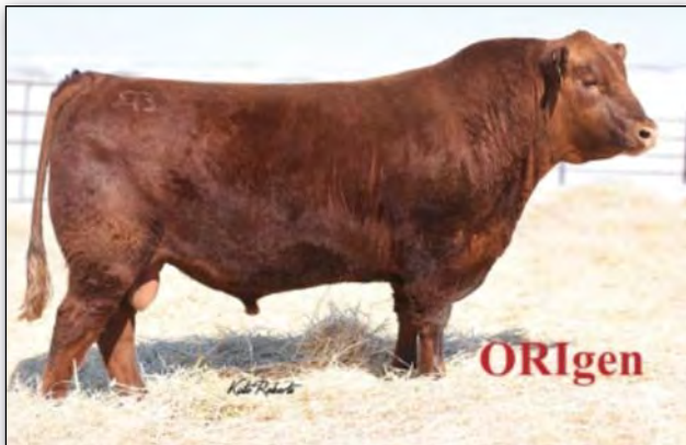
BROWN BLW FANTASTIC C5959