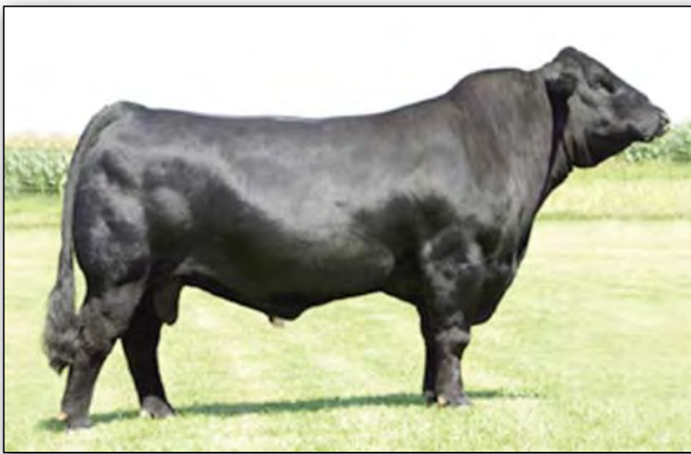
CNS DREAM ON L186, sire