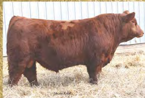
Lot 51 – CROSSHAIR 161G #3637203