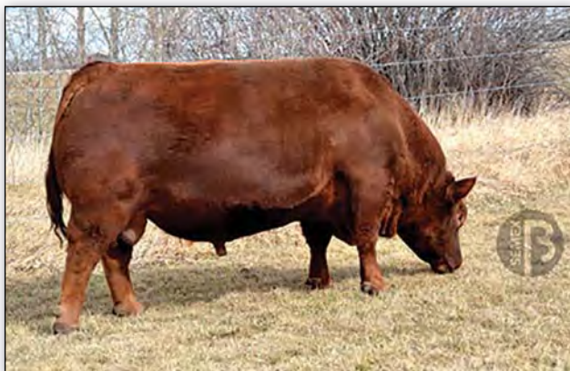
RED TOWAW ORAZI CALIDAD 130Y

AB RED TOWAW ORAZI CALIDAD 130Y #2424998 BD: 7/2/11 % Dam's MPPA: Dam's Age: 5 BW: WW: WR: YW: YR: %IMF: Ratio: REA: Ratio: