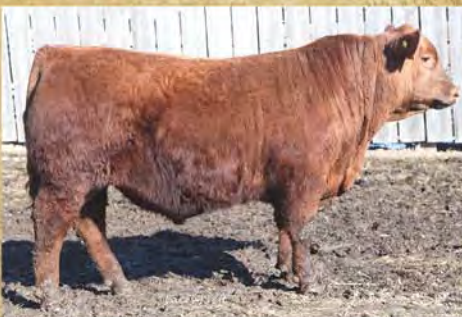
Lot 2 – HBR ZION 906 #4177400