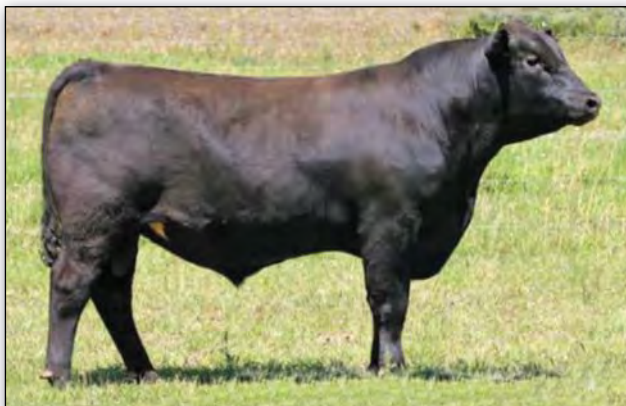
LEACHMAN ABSOLUTE RED G108D