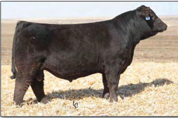
CCR COWBOY CUT 5048Z

I CCR COWBOY CUT 5048Z #2703910 BD: 2/20/12 PUREBRED POLLED BLACK BW: WW: WR: YW: YR: %IMF: Ratio: REA: Ratio: 788 1306 5.00 116 14.2 100 K TRIPLE C SINGLETARY S3H HOOKS SHEAR FORCE 38K R CCR MS 4045 TIME 7322T LUCAS JOSIE 19K HTP SVF IN DEW TIME CCR MS PRETTY 4045P