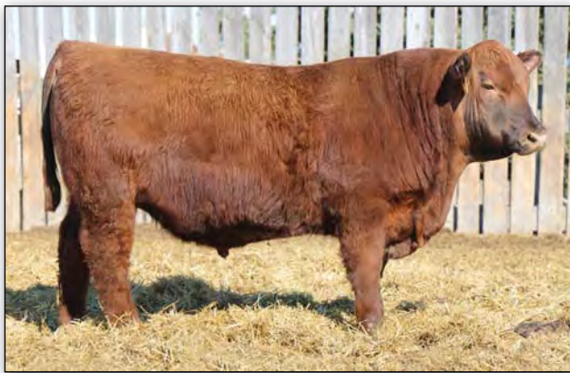
MLK CRK FUSION 6205