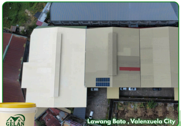
Lawang Bato , Valenzuela City