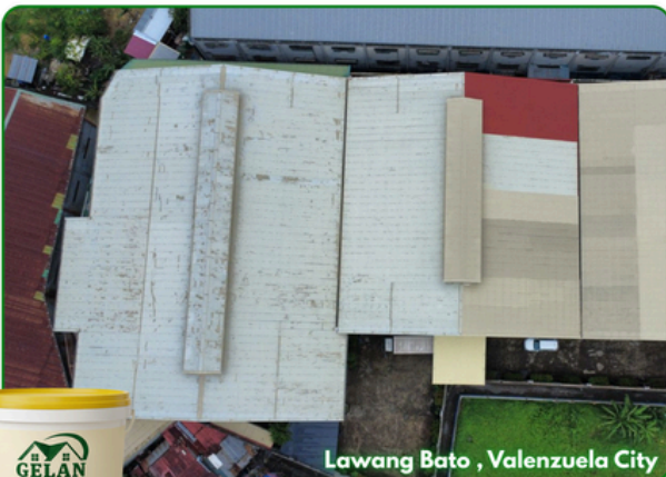
Lawang Bato , Valenzuela City