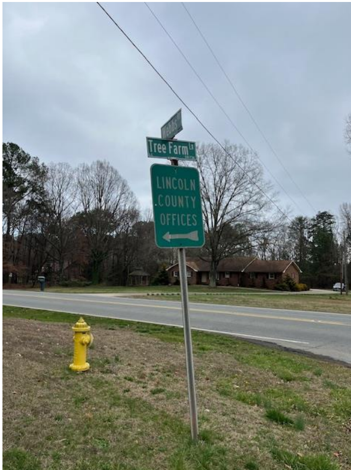
Obsolete “Lincoln County Offices” sign at Webbs Rd and Tree Farm Ln