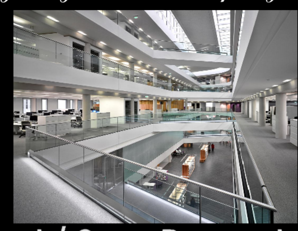
Open Standard / Open Protocol Lighting Controls