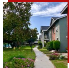
■ Move to a new neighborhood