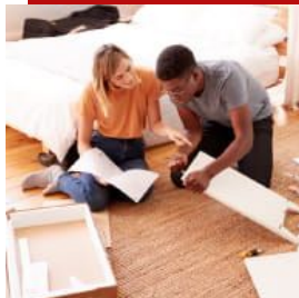
■ Adjust for your lifestyle