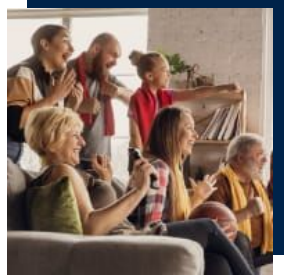
■ Move closer to family