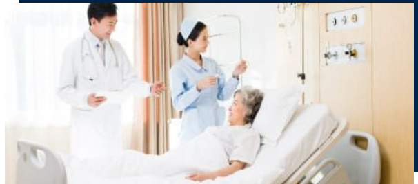
■ Gain funds for future needs (medical or otherwise)

Tip: As with any change in property ownership, you'll want to consider the tax implications around downsizing and consult a real estate or tax professional. If your motives are financially-based, considering the taxes you'll have to pay in selling your current home is a key consideration.