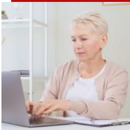
■ Funding retirement