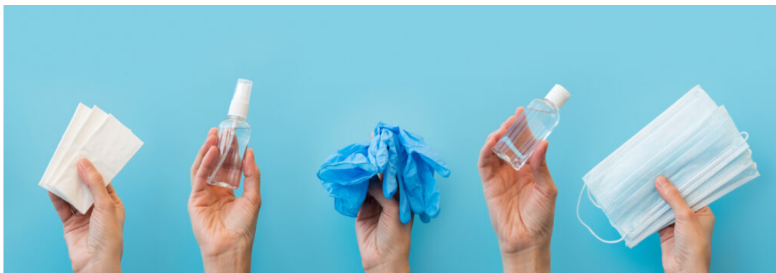
Masks, Hand Washing, Sanitization and More!

Instructors will be provided and required to wear an approved mask and/or face shields when in the studios. Shepherd Private Coaching will also require students over the age of 5 yrs to wear masks in public areas and will offer masks and/or face shields to any guests who need one, free of charge. Students/Participants between the ages of 2-5yrs are strongly encouraged to use a mask if they are able. Students may be required to wear masks when appropriate physical distancing or barriers cannot be maintained. Gloves will continue to be worn by instructors who require them to do their jobs, such as instructors who clean public areas. Additional categories of instructors required to wear PPE will be identified by experts as the case may change.