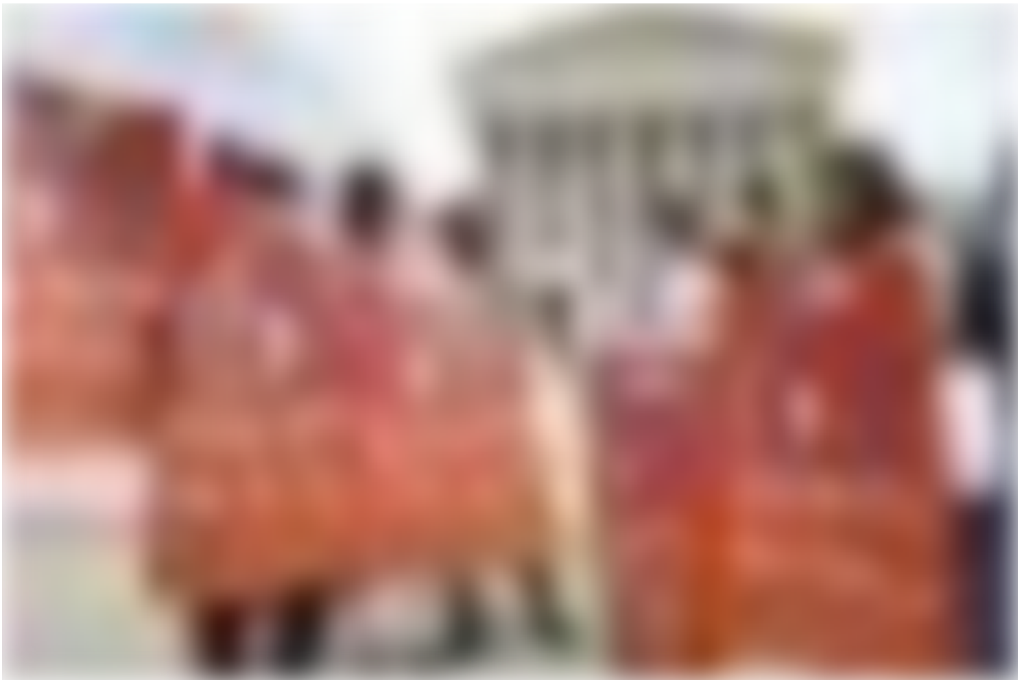
📷 Still protesting inequality, 60 years later.

After the Brown v. Board of Education ruling in 1954 that mandated the desegregation of US public schools, the system became essentially a form of resegregation (pdf, page. 4). Those with money and resources could game the system to ensure that their kids tested into the higher-level classes, and poorer children, many of them black, were left behind in the lower-level classes.