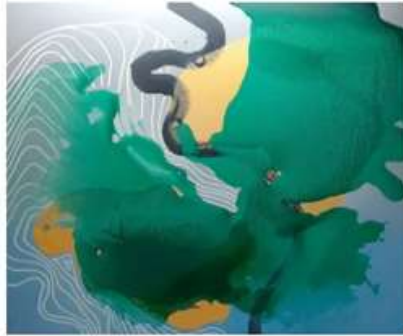
O'Delle Abney Ethereal Series 08, 2024