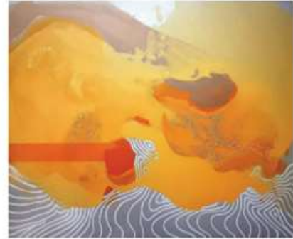
O'Delle Abney Ethereal Series 06, 2024