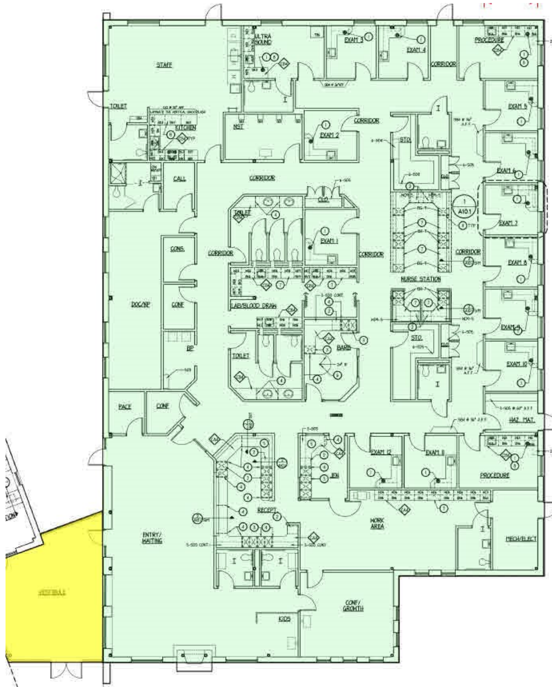
First Floor 7,544-10,044 SF

PROPERTY CONTACT CRAIG MATHISON 260.804.6221 cmathison@mathisoninv.com mathisoninv.com