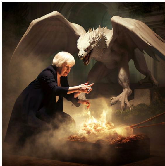
Janet Yellen @ US Treasury

It is also the focus of the next chapter of this handbook: specify.