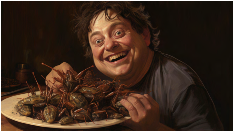
NPC Eats GMO Bugz

In the grand game of life, NPCs are those who wander the paths laid before them unquestioningly. They've accepted the world as it's been presented, a stage set by the directors of the fiat system, mistaking the set's props—wealth, status, security—for the plot itself. Understand, Dear Peer, these characters aren't our adversaries. They're our charges, fellow players yet to realize they're part of the game.