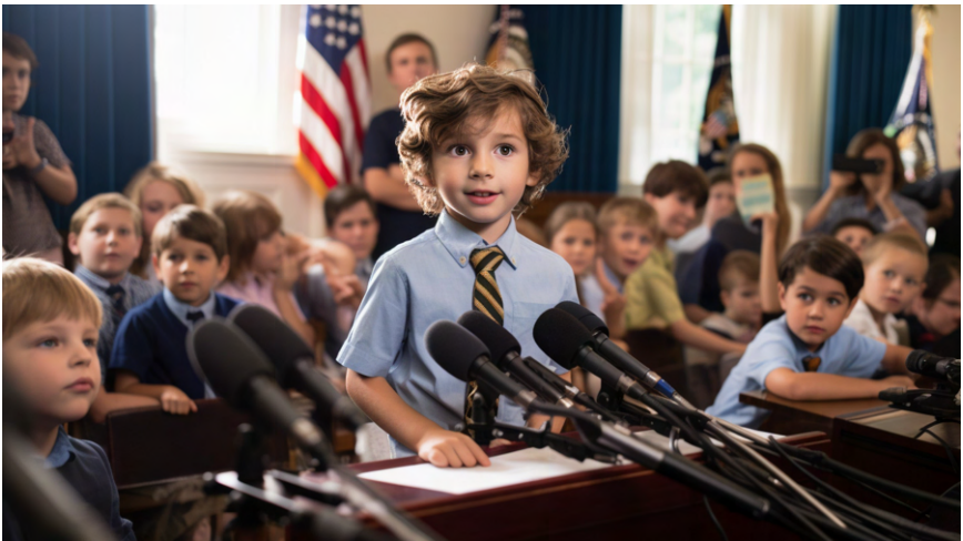
Big Kid Questions

Understand this: your narrative must be woven with the threads of triumph, potential not just for victory but for legacy. Speak to them of the great game, the revolution that is Bitcoin, and the champions it has already crowned. They must see it as the ultimate league, one that legends are made of. But also a serious game of reshaping world power and as integral to WW3 as the atom bomb was to WW2. Getting them to ask the right questions is usually enough.