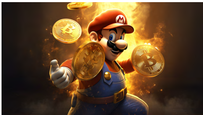
Main Player Energy of World's In-Game Money

Understand this: they require the spell of raw truth, the immutable facts of Bitcoin's design, the reality of its resilience. With them, your journey must be one of intellect, a quest challenging enough to ignite their smothered curiosity.