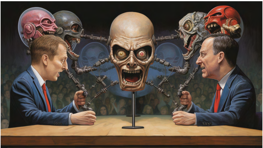
Pumped Full of Anger

Yet, both groups are puppets dancing on strings pulled by the same master: a deep-seated allegiance to the US dollar, mistaken as an integral pillar of their nation's identity. The fiat system's hypnotism runs deep, intertwining with patriotism, hidden in plain sight.