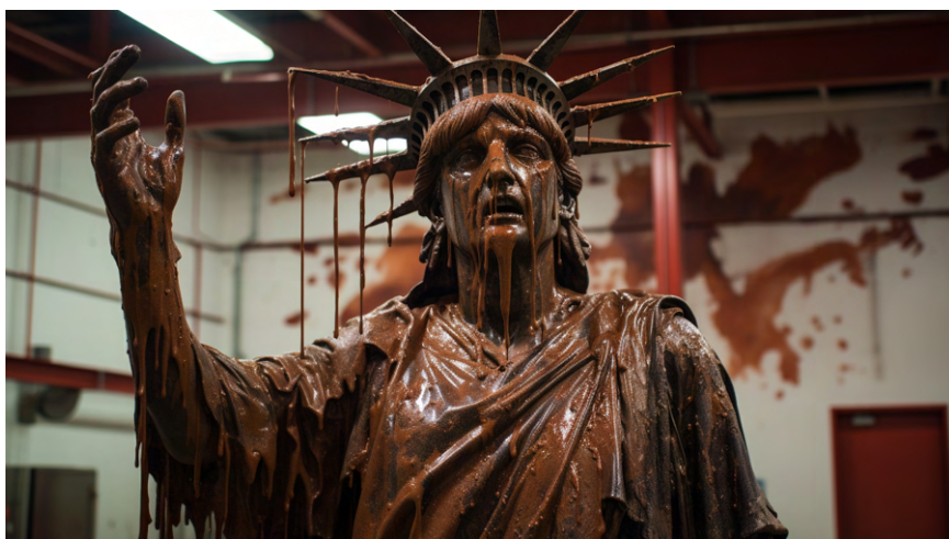
Trusted Turd Parties

Furthermore, this spell is not an end in itself. The dissonance it creates is but a crack in the façade, an opportunity for deeper questioning and reflection. Once cast, it is essential to be there to guide the shaken but newly receptive minds toward the truths hidden behind the distortions — truths about power, autonomy, and the illusory narratives that have held sway for far too long.