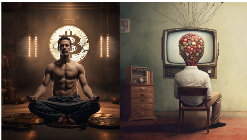
BTC's 3-Letter Agency vs. Three Letter Agencies

Our NPC friends and family are really just mentally handicapped and we should treat them that way. Would you get angry with a blind person for bumping into you? Would you yell at a slow person if they made a mistake? Of course not. Our NPC friends and family lay spellbound and abused by fiat information sources. This handbook is for those who have the time to bother.