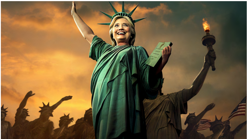
Hillary Nazi Reprogramming

Understand this: to reach them, your tale must be one of empowerment, the control that Bitcoin offers each individual, the rules it enforces on itself. It's not the wild woods but a garden where each may grow their tree of prosperity. The Karen will always laugh at the incompetence of others.