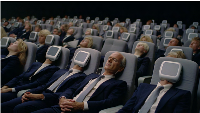
Archetypes of Slumber

Each of these NPCs requires a different key, a unique combination of words in your incantation of awakening. Identifying them is the cornerstone upon which the magic of enlightenment is built.