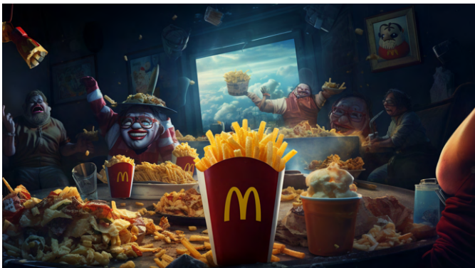
Junk Food Journalism

Begin by empathizing with their journey, the years they've spent safeguarding their reputation. Your words must not confront but evoke a sense of sorrow for the lost potential. Pity them for their information sources. Keep the frame about information consumption, and be sure to qualify mainstream media as Junk Food Journalism. Do not argue statistics, definitions, graphs, data, studies, etc. If pity isn't strong enough, the magic increase is to move pity up to mocking. Mock their trust, and in this emotional alchemy, you might just find them more receptive to the golden reality of trustless systems.