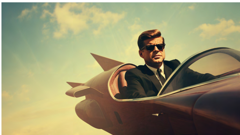
JFK Flying Into the Bitcoin Era

Great greetings persuade. Greeting people with your extreme Satoshi-induced optimism is a reliable shield and dagger. Saying something like, “I love life and I’m enthusiastic about the future,” can create wild reactions. Those who are especially energy and media illiterate have superstitious eschatological beliefs around climate change and are depressed when thinking of the future. Such a small greeting and its reaction may be enough for you to know to avoid someone, or for them to get awakened by your presence in their life. Consistency in optimism will especially provoke this reaction, and can become more likely to succeed as NPCs of all types may simply want to model your optimism.