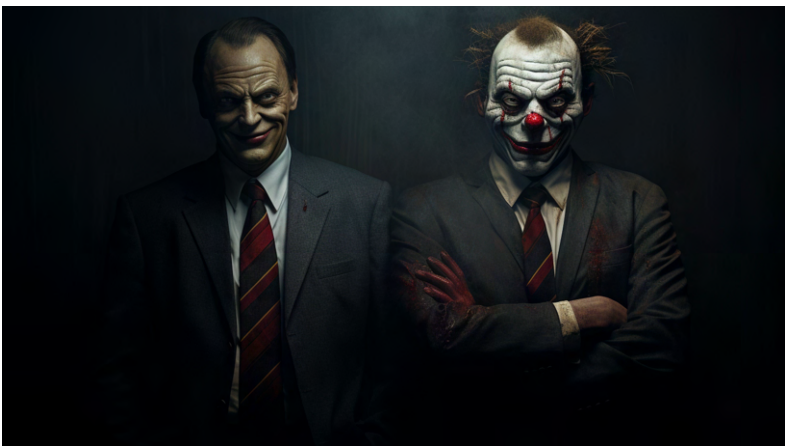
Govern Mental Agencies

Use it to gently unmask the folly of the financial systems they defend, the ludicrousness of centralization, and the slapstick comedy that is inflation. It's a risky spell, for the mirror shows both the world's absurdity and their role within it. Tread wisely.