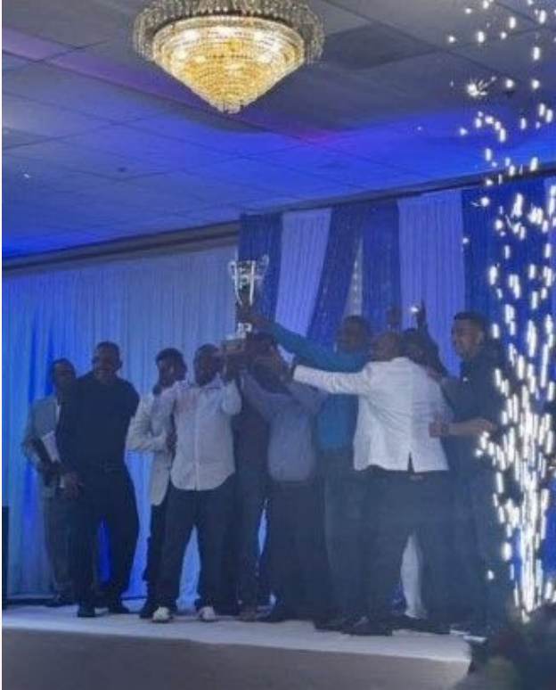
TIV with the Winning trophy (Soccer)