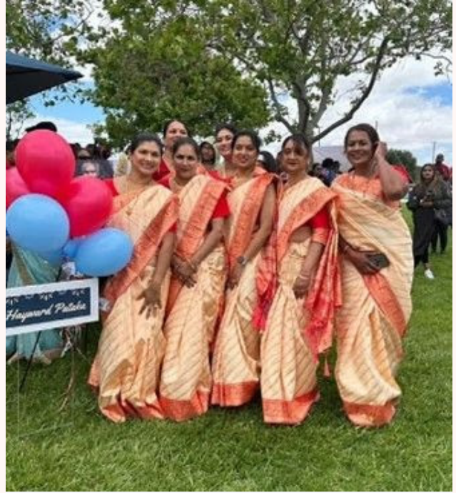
TIM's – Sangam of East Bay