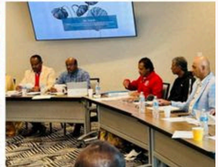
2024 AGM Highlights

A Note from ..... Past National President. Current Trustee and Chair of Advisory Committee