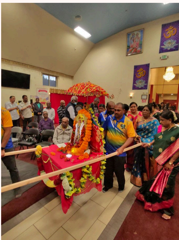
Seattle Sangam Board members gathered at Hanuman Nagri Temple for Perrutassi Pooja

In an effort to support its ongoing initiatives and community programs, Seattle Sangam is planning a raffle ticket fundraiser soon. This fundraising activity aims to engage members and supporters alike while raising essential funds that will contribute to future events and projects organized by Seattle Sangam. The raffle promises exciting prizes and serves as an opportunity for community members to come together in support of their shared goals.