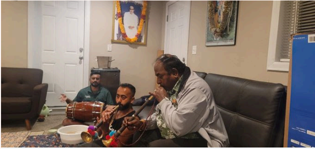
Seattle Sangam Cultural Group Sehnai Training

The Seattle Sangam Cultural Group continues to thrive with regular practices of Therrukutthu, Sehnai, and kirtan being held every second week. These sessions provide members with opportunities to hone their skills in traditional arts and music forms while fostering camaraderie among participants. Engaging in these cultural practices not only enriches individual talents but also strengthens community bonds through shared experiences.