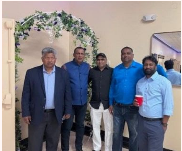
Sangam of East Bay officials

The organizers succeeded in bringing the community together for a day filled with joy, learning, and unity, marking a significant achievement. This year's Sangam beautifully blended tradition and modernity, standing as a testament to the thriving cultural fabric of the Fiji South Indian community. For the South Indian diaspora in California and Washington State, Sangam is not just an annual event; it is a celebration of identity, a reminder of our shared values, and a vibrant confluence of tradition and innovation.