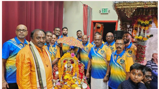
Seattle Sangam Board members gathered at Hanuman Nagri Temple for Perrutassi Pooja

In line with its commitment to community service, Seattle Mathaar Sangam helped prepare Parasadam and food for the Perrutaasi Pooja at Hanuman Nagri Temple. This initiative reflects the organization's dedication to supporting cultural and religious events within the community, fostering a sense of unity and shared purpose among members.