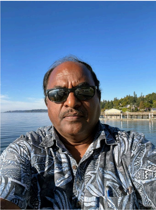
Past National President. Current Trustee and Chair of Advisory Committee