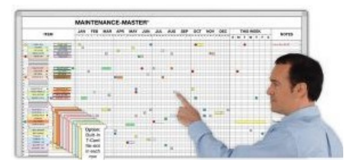
Maintenance Master Plan

At the end of Day 7, state to everyone that your facility is the best and we will all prove it. Point out that they have already mastered the simple tasks they were challenged with and succeeded in moving towards Maintenance Excellence.