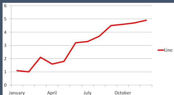
Maintenance Rework Example

Exception reports are sent to the Maintenance Manager if any of the above metrics are not within the agreed upon range.