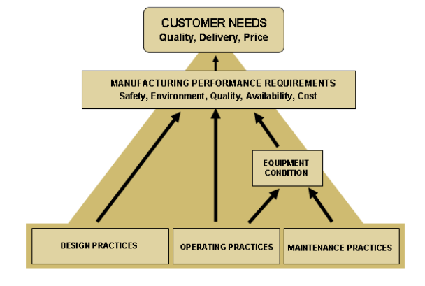
Figure 1: Managing manufacturing performance requirements to meet customer needs

The third requirement is Maintenance Practices that maintain the inherent capability of the equipment. Deterioration begins to take place as soon as equipment is commissioned. In addition to normal wear and deterioration, other failures may also occur. This happens when equipment is pushed beyond the limitations of its design or operational errors occur. Degradation in equipment capability. Equipment downtime, quality problems or the potential for accidents and/or environmental excursions are the visible outcome. All of these can negatively impact operating cost.