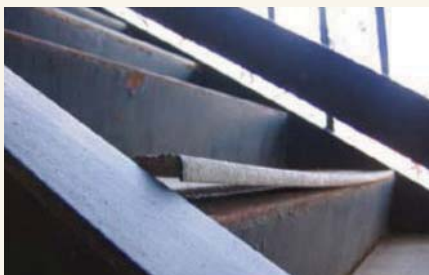
Figure 2 - Stair Tread Problem, a tripping Hazard