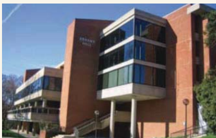
Figure 5 - One of the Barracks Facilities at Walter Reed Army Medical Center