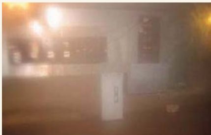
Figure 4 - Major Steam Leak in Basement Area of Garrison Facility