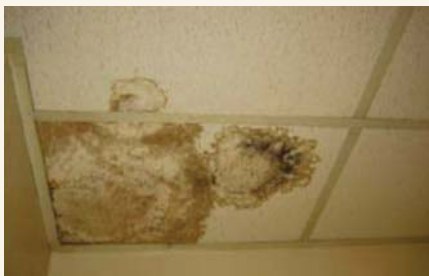
Figure 3 - Water Leak in a Garrison Facility at Walter Reed