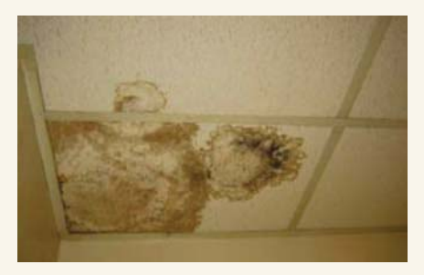
Figure 3 - Water Leak in a Garrison Facility at Walter Reed