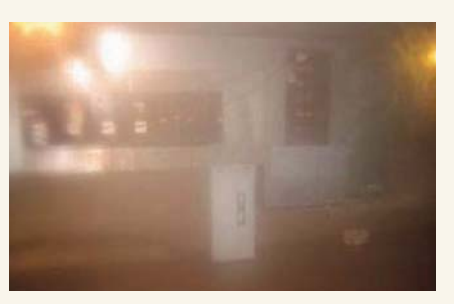
Figure 4 - Major Steam Leak in Basement Area of Garrison Facility