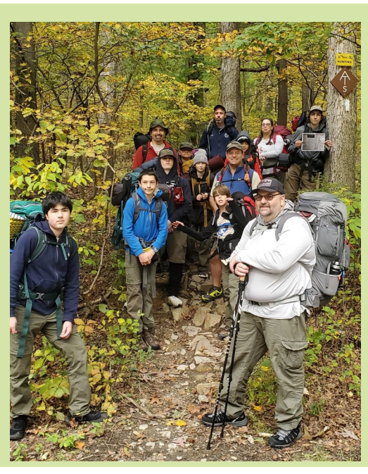
DEC HAWK MOUNTAIN TRIP