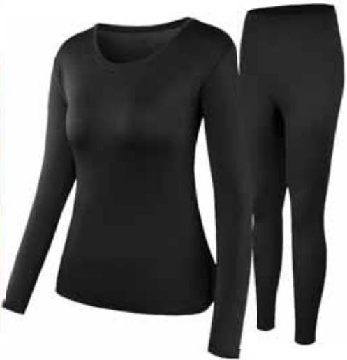
BU214 Ladies Wool Rich Undersets (Undershirts&Underpants)

Composition : 50% Merino Wool, %50 Polyester (180 g/m2) Sizes : S, M, L Colors&Designs : Black