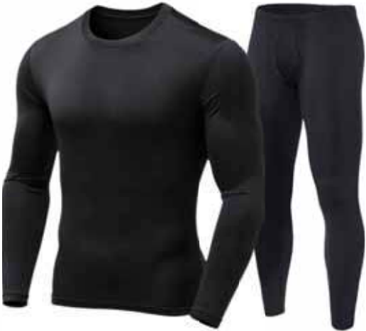
BU212 Men Wool Rich Undersets (Undershirts&Underpants)

Composition : 50% Merino Wool, %50 Polyester Sizes : M, L, XL Colors&Designs : Black