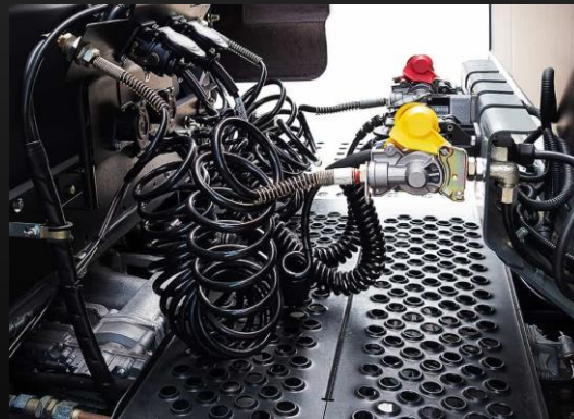
Electrical Spare parts