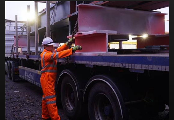
Accessories and Safety