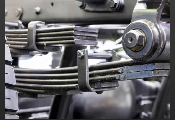
Suspensions and Axles