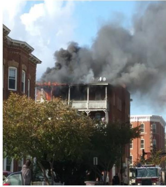
Figure 3 and Figure 4. The advanced fire conditions, extending beyond the room of origin (the back bedroom), required the nozzle team to flow and move to gain control over the rear egress path and protect the victim who was trapped on the porch, while the ladder company positioned the aerial to affect the rescue (courtesy of Nbfd).

A continuous size-up to read the conditions and anticipate their progression is imperative to the initial selection of the fire attack method, as well as the need for any modification throughout its execution. As with anything else on the fireground, critical-thinking and commonsense must prevail. If you can see your feet, walk as you move in. If you cannot, drop down to the floor and move in a “tripod” position. Whenever there is visibility at the floor level, take advantage of it and briefly scan the area for potential victims, the fire, and the general layout of the space prior to moving in and opening up; as the disruption of the smoke layer will temporarily obscure your vision once the stream is applied. When that “clean space” is not present, open the nozzle as soon as you enter the attack lane and are on the approach, or the conditions otherwise warrant it. It cannot be emphasized enough that achieving knockdown requires base water application. When the stream is not reaching the seat of the fire, it is only momentarily knocking-back the burning fire gases, and conditions will begin to rebound as soon as the nozzle is shut-down. If this occurs, the nozzle must be immediately re-opened and should remain that way throughout the advance until the fire is knocked-down.