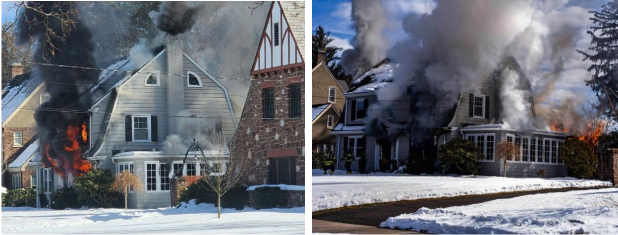
Figure 5 and Figure 6. The first-due companies were met with 50% involvement of the first-floor, with fire venting out of the front door and two windows, as well as a trapped occupant on the second-floor. The nozzle team had to initiate their attack from the entryway and push through to the back.

The associated techniques are nuanced and take proper instruction and continual practice to develop and maintain the proficiency to operate effectively and efficiently.