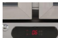
0 - 10 degrees electronic temperature control

900mm Width x 500mm Depth x 840mm Height (Door handle extra 45mm depth)