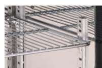
Chrome adjustable shelves