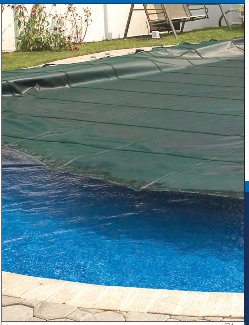
Spring opening of an algae-free pool, covered all winter long by SmartMesh