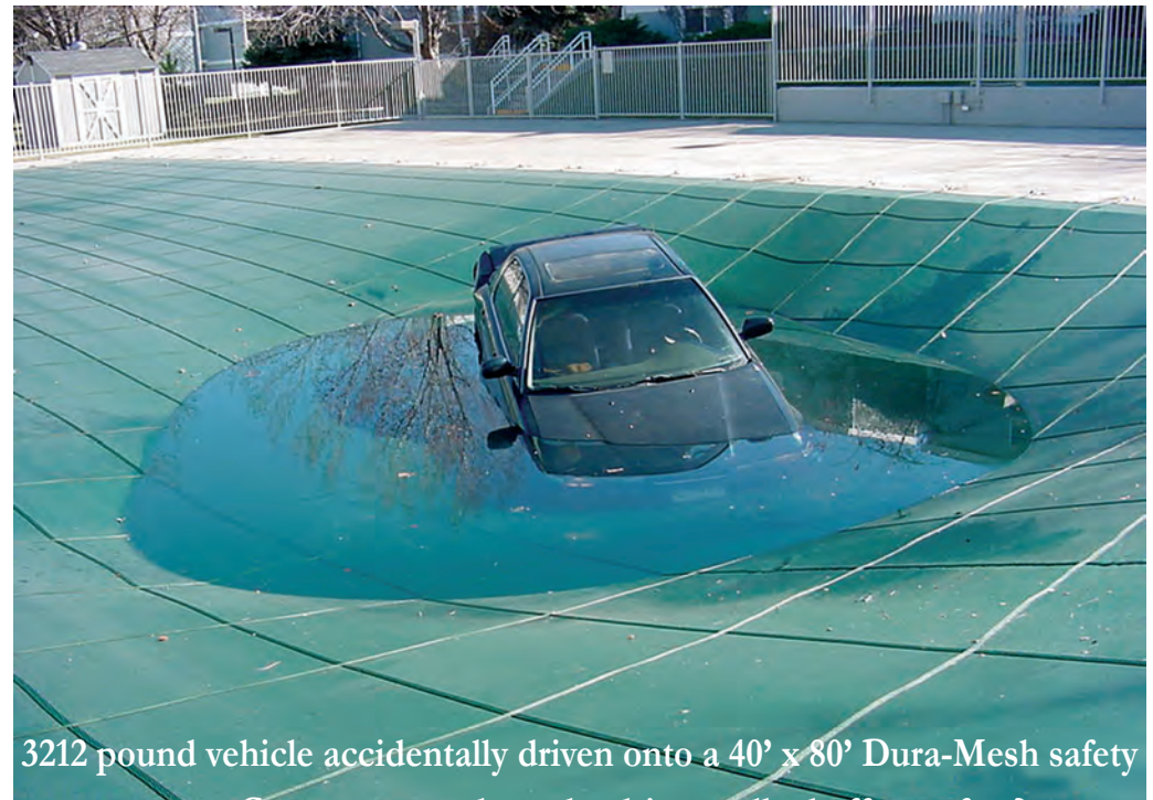
cover. Can you spot where the driver walked off to safety?