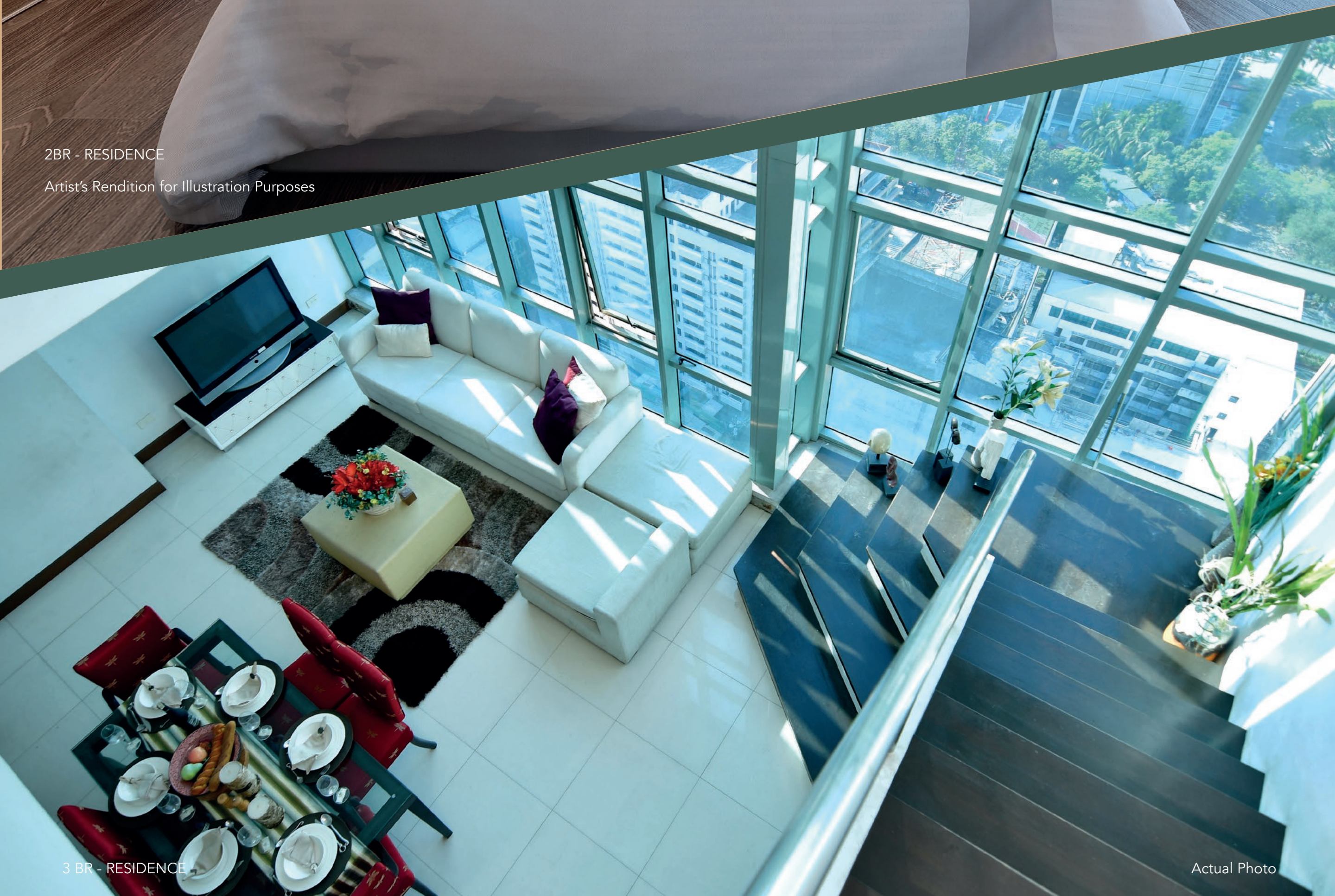
3 BR - RESIDENCE