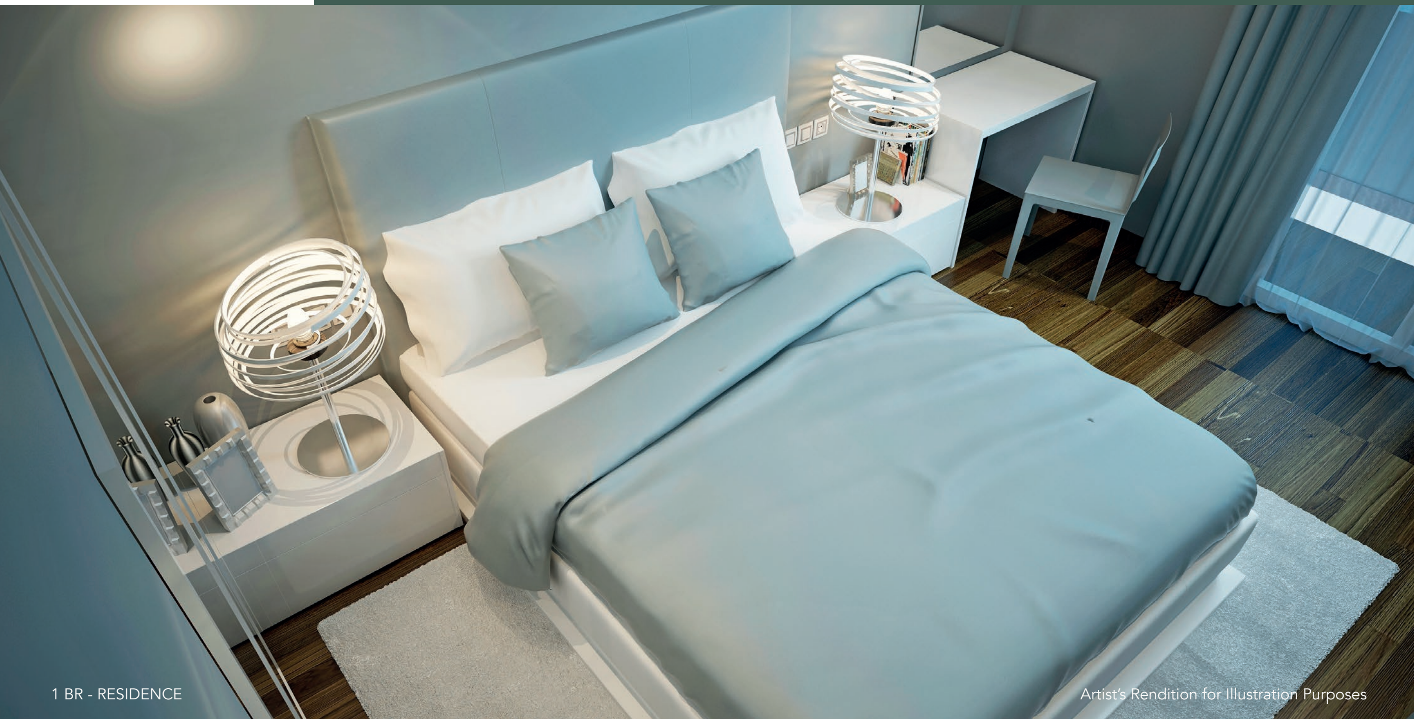
1 BR - RESIDENCE