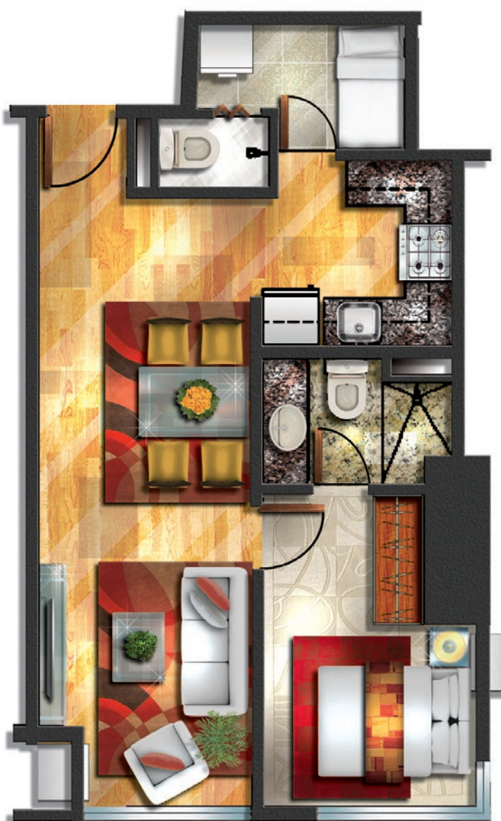
1 Bedroom - Unit 3 Total Area: 52.91 sqm