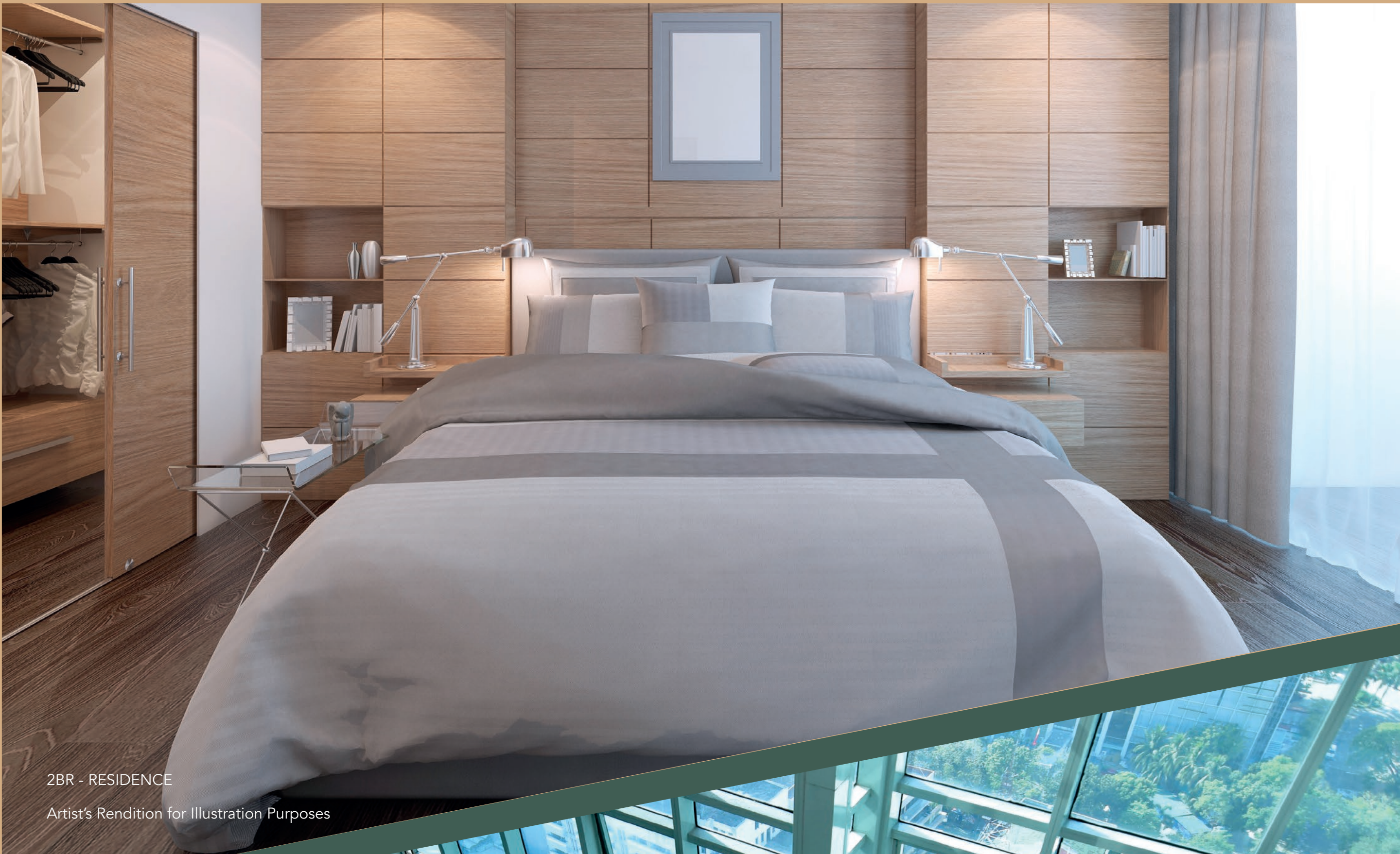
2BR - RESIDENCE Artist's Rendition for Illustration Purposes

Varying from 80 to 112 sqm, the 2-bedroom units are designed to accommodate the lifestyle of entrepreneurs and expatriates.