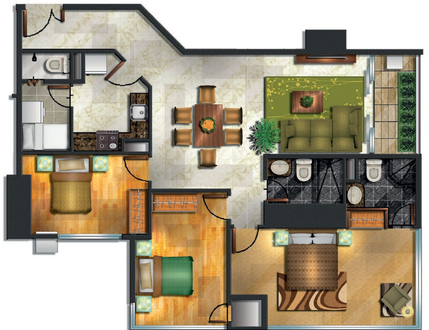
3 Bedroom - Unit 3 Total Area: 118.21 sqm