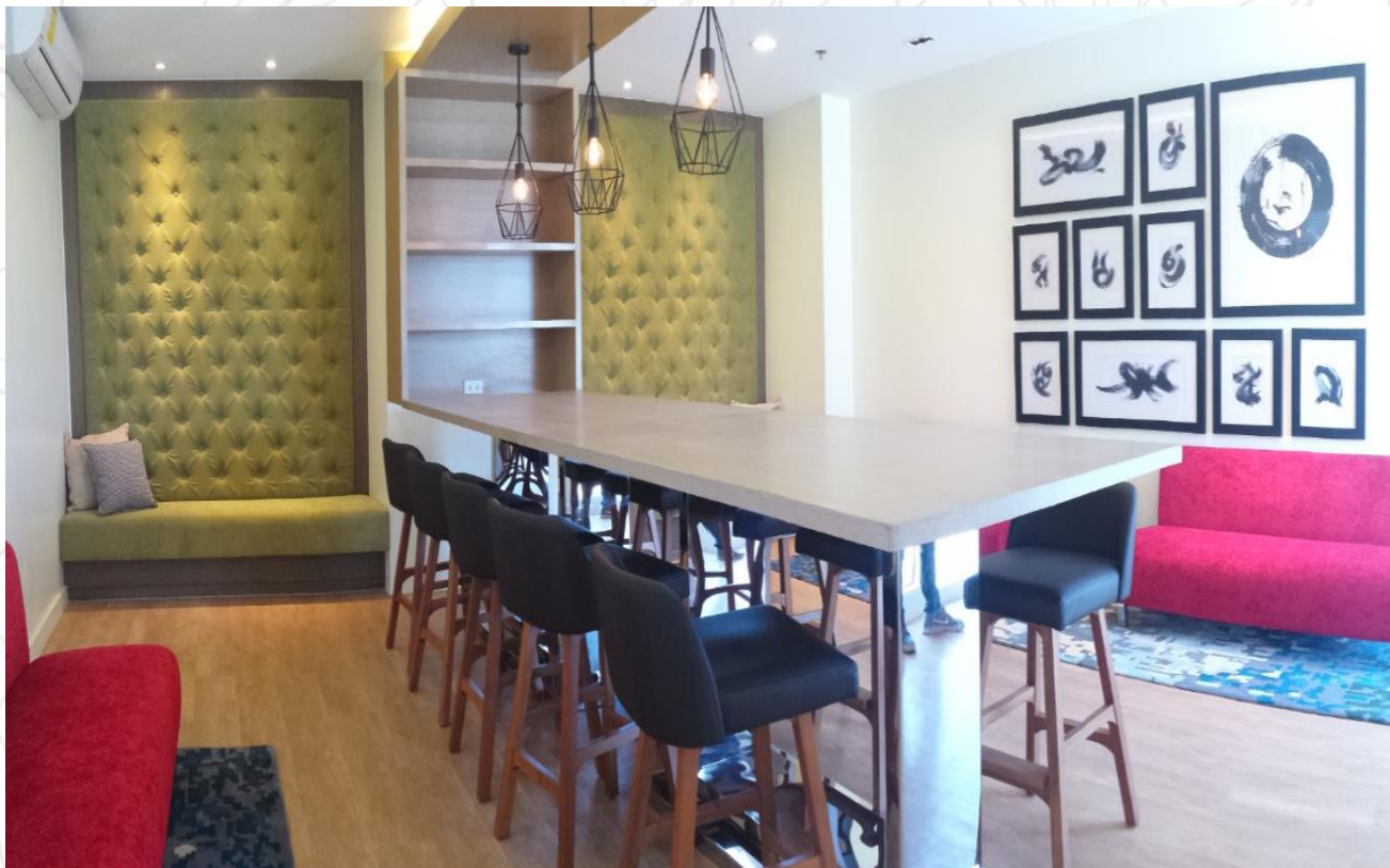
PH 1 READING LOUNGE