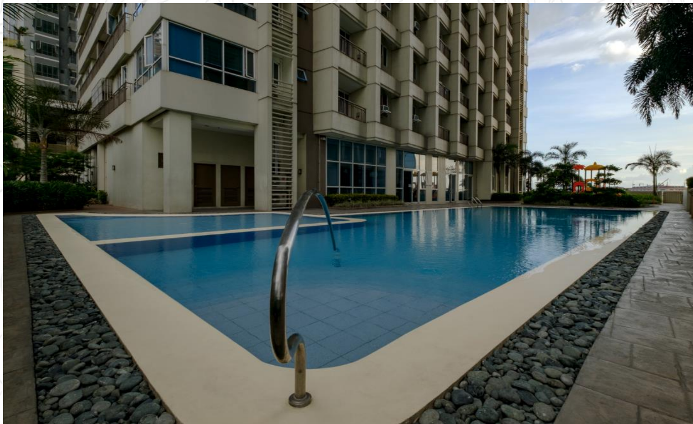
PH 1 PLAYGROUND & POOL