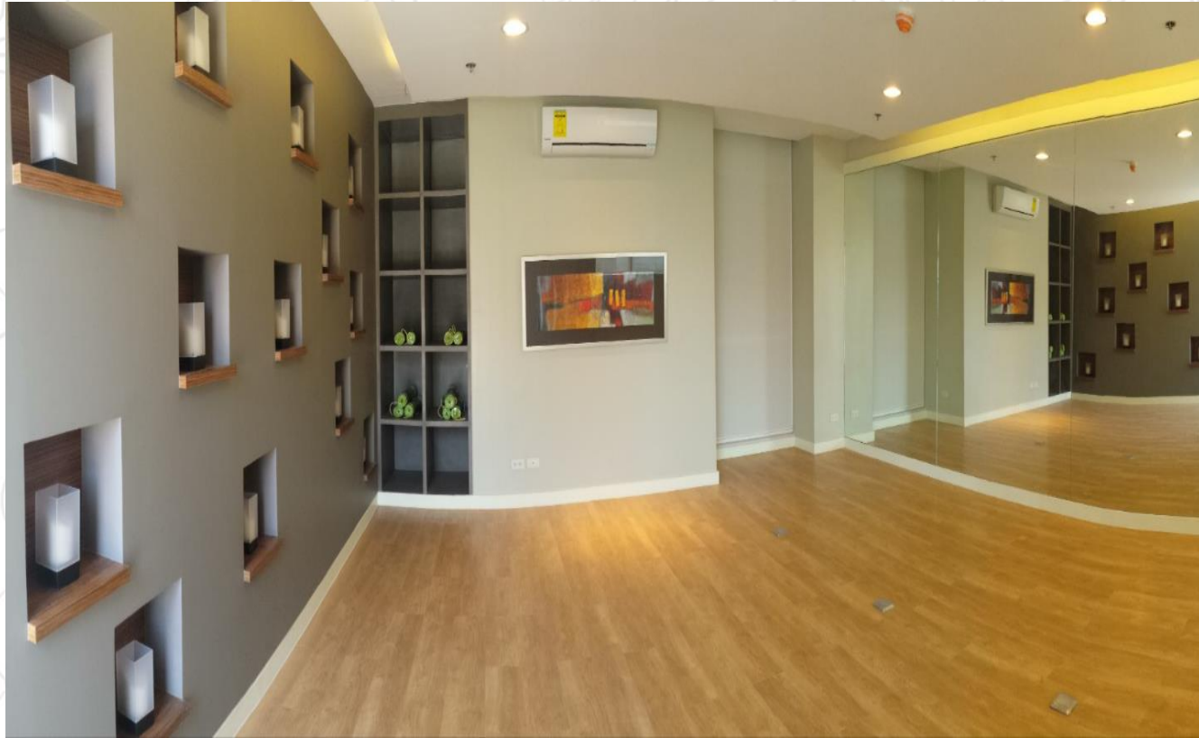
PH 1 YOGA ROOM