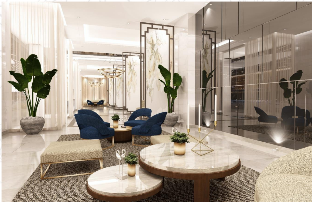
PEONY LOUNGE AREA