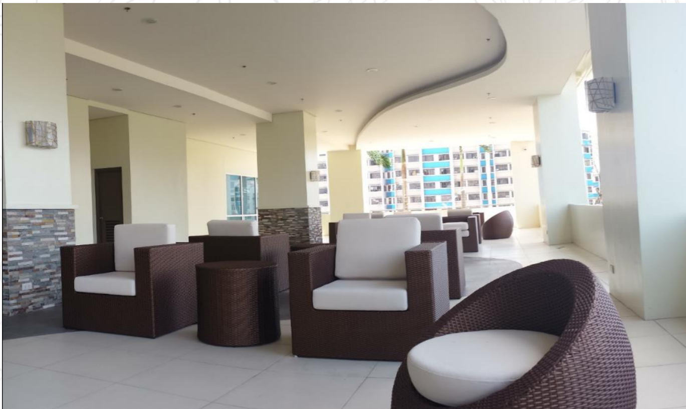
PH 1 OUTDOOR LOUNGE