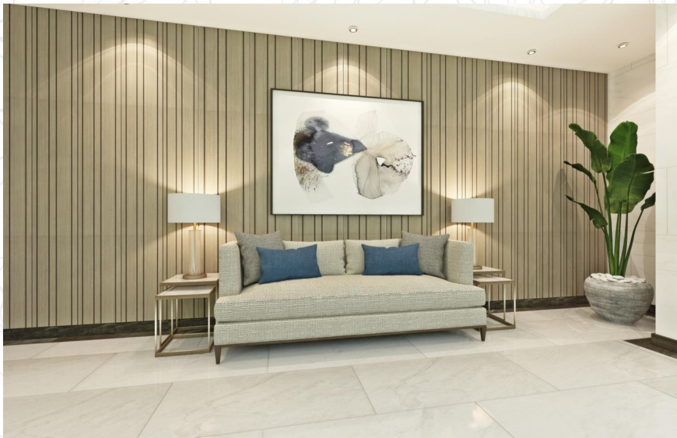
PEONY AMENITY LOBBY