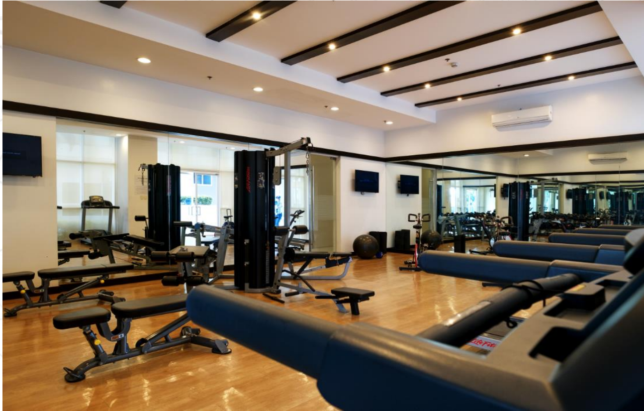
PH 1 GYM