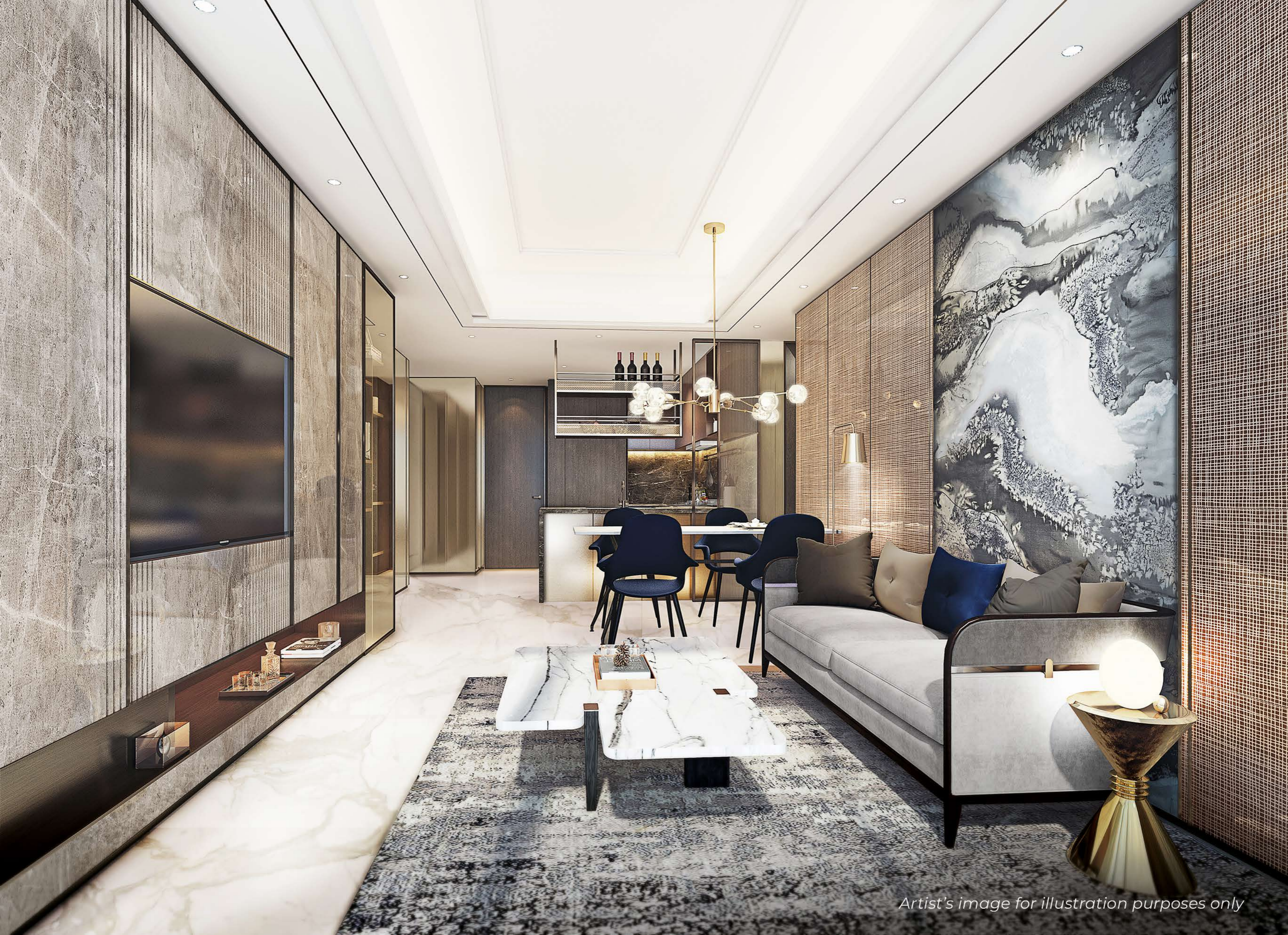
Artist's image for illustration purposes only