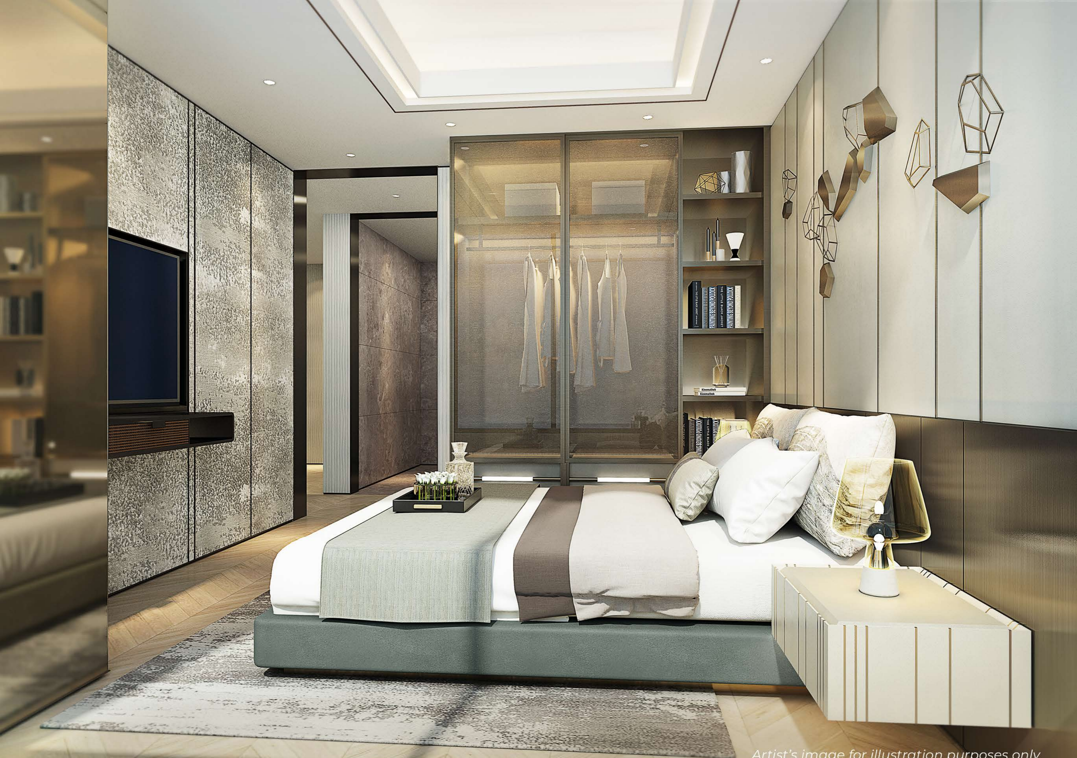
Artist's image for illustration purposes only