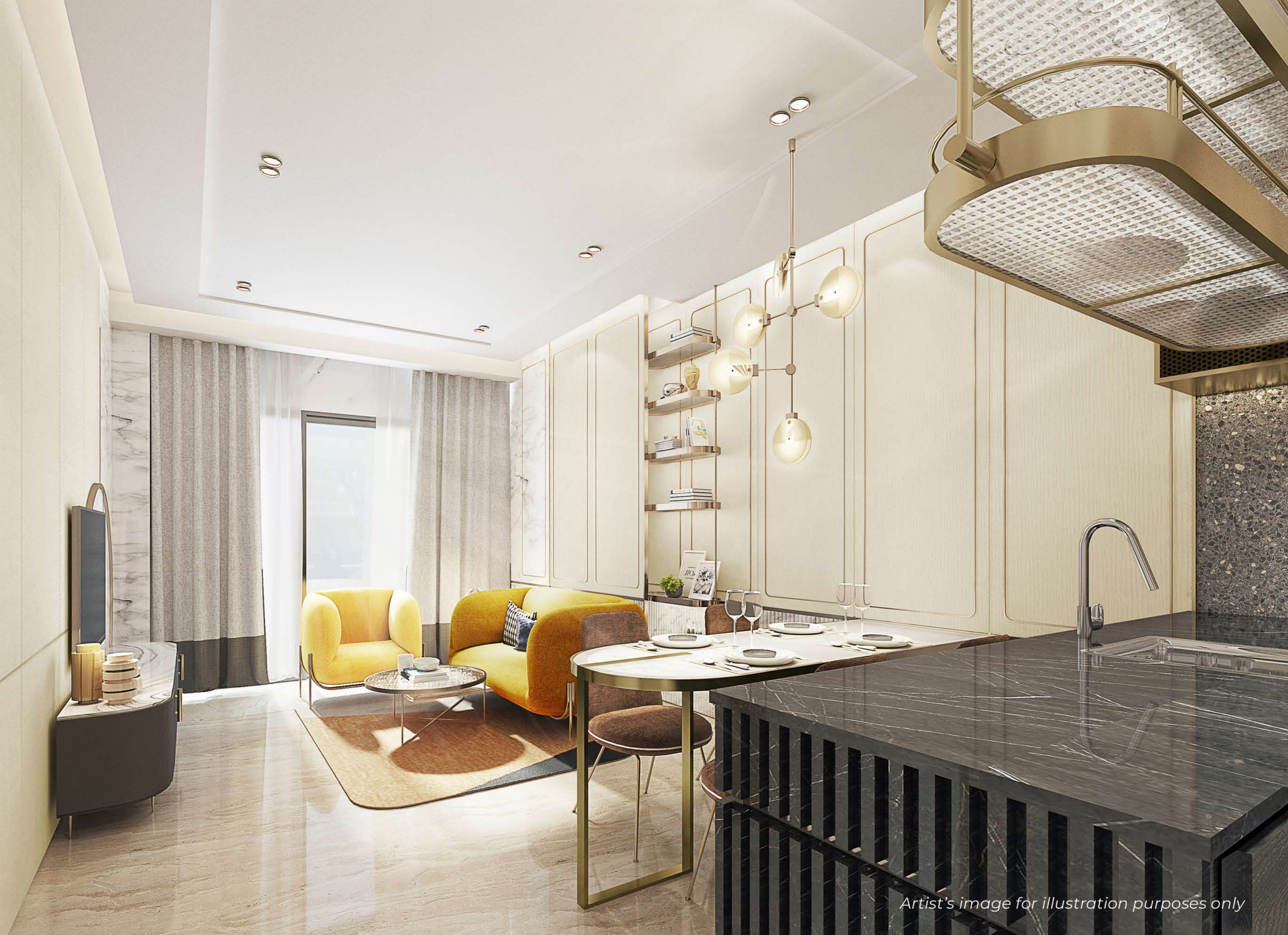
Artist's image for illustration purposes only