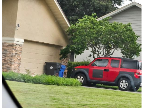
204 Running Horse