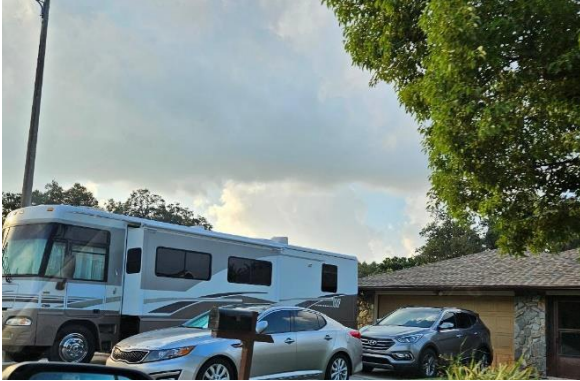
528 Sportsman Park Drive