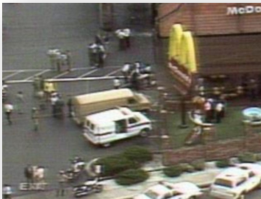
The crime scene at McDonalds.